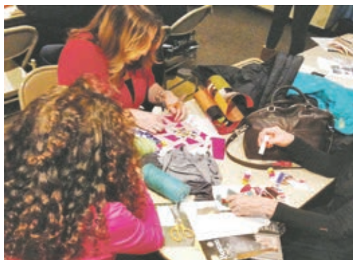
Art Social collage fun in action

Teens with some experience and a strong interest should look here, too!