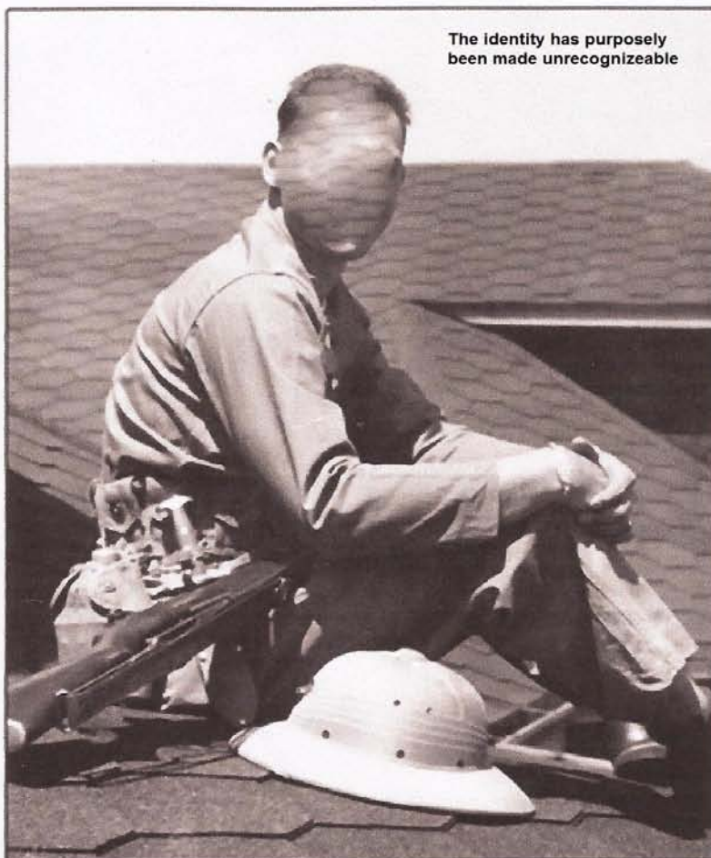
The identity has purposely been made unrecognizable