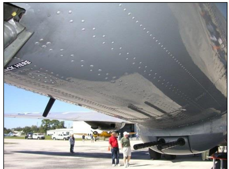
"The underside of Fifi near the tail skid. Note the number of rivets used on only this small portion of the plane."

COLLECTING THE PLANE-For years, the Commemorative Air Force (CAF), formally known as "the Confederate Air Force", was looking for a B-29 to add to its fleet of Vintage aircraft. In 1971, a CAF pilot in the National Guard happened to fly over a group of what might be B-29s on the California desert near China Lake, at a US Navy weapons center. The aircraft had been used for gunnery practice and missal targets but had been parked there for the past 17 years, and you know what heat, sand, and vandals can do to a parked aircraft over that period of years.