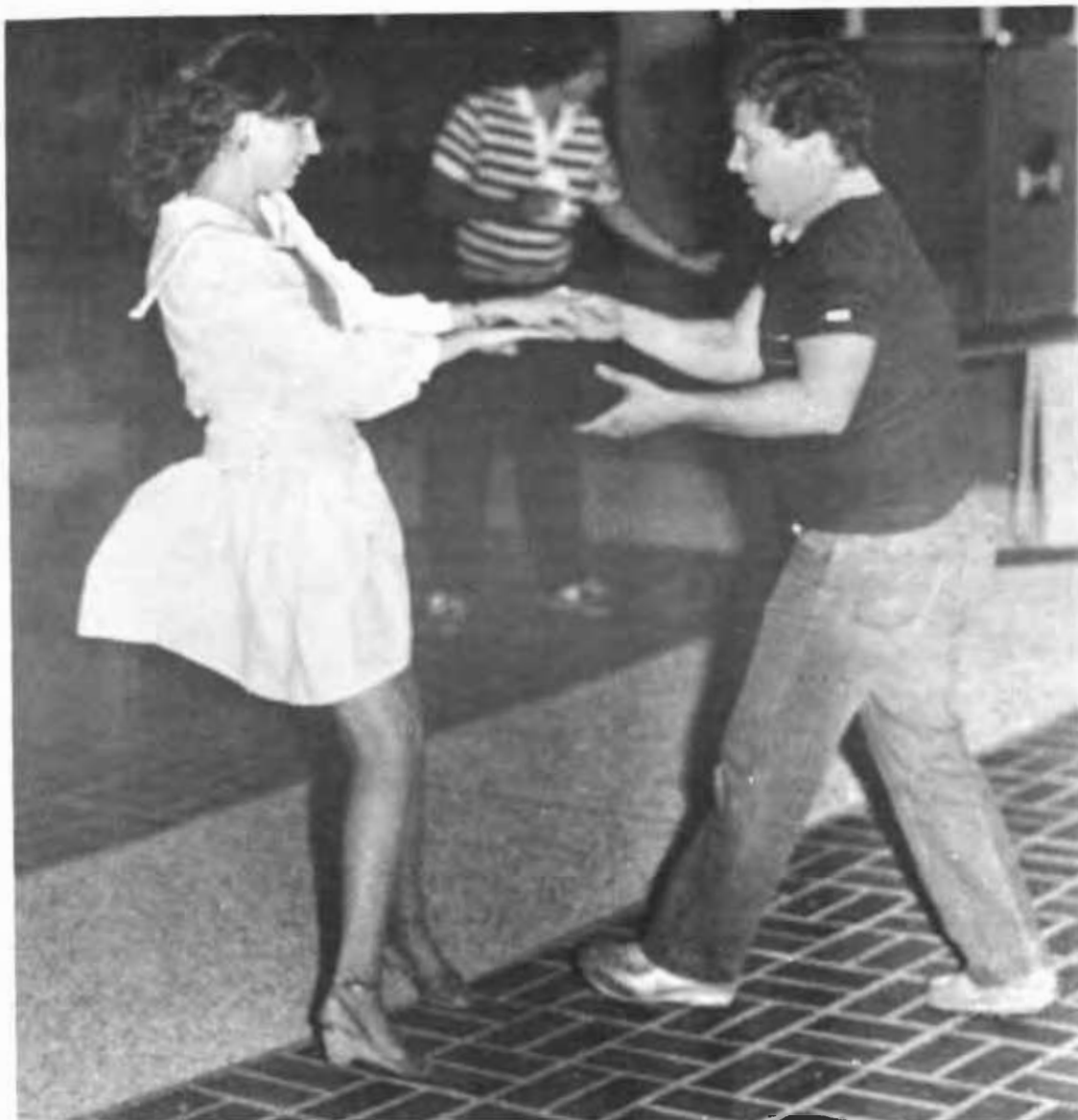
'The Party' is one event that student planning and student involvement turned into a smashing success.

Pages 5 and 6 have forms and more information to assist students in joining organizations of their choice.