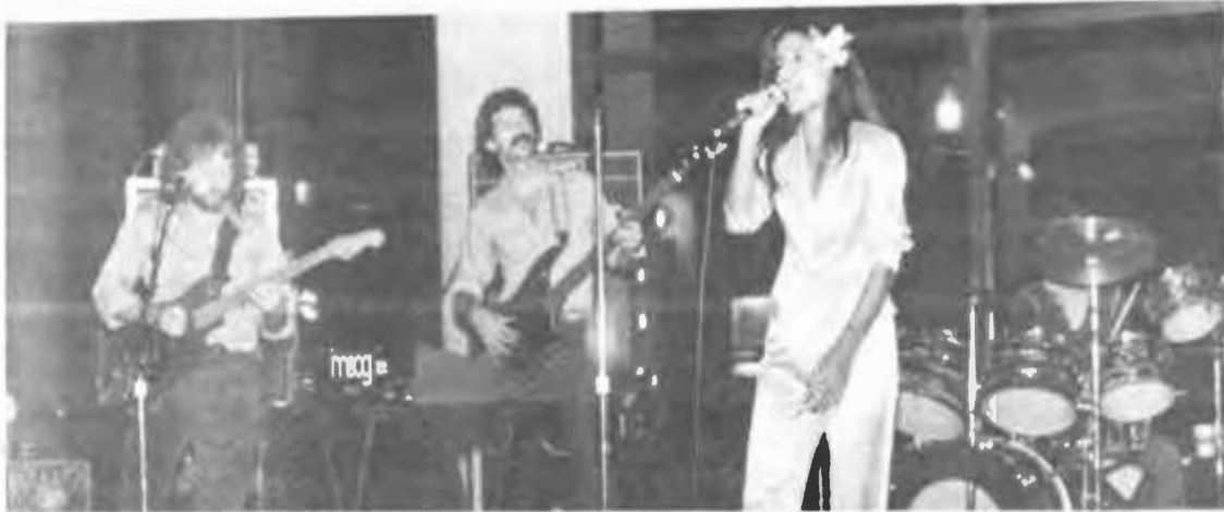
Special guests enjoy the party at the Student Union