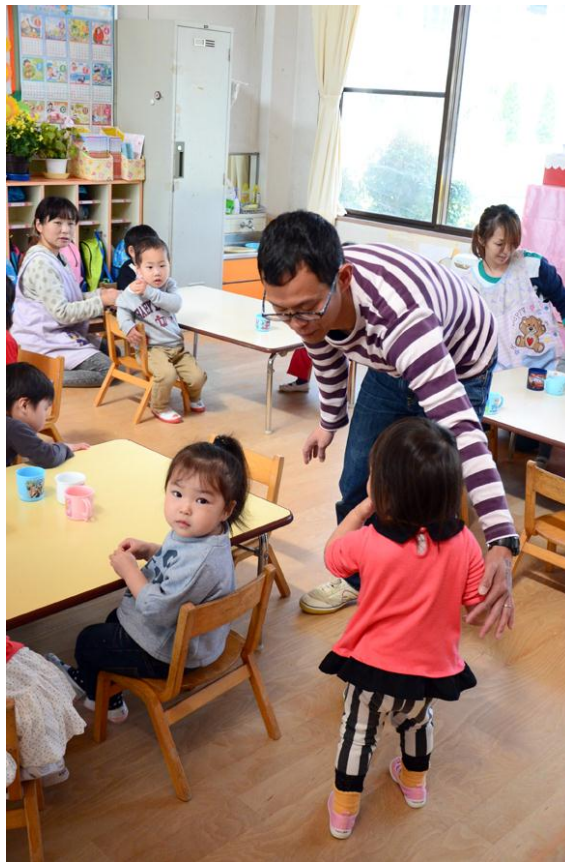
Jonan Day Nursery