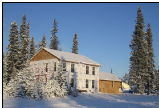
House of Hope '07 Under Construction