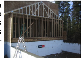
Foundation of House of Hope '07

On the first day of school staff and student devotions focused on the importance of a good foundation. Our students learned that only a well-built, solid foundation is able to withstand the storms of life and the test of time. This is true of both our spiritual lives and in home construction. The House of Hope '07 is a key component in building skills and confidence into our students while the ultimate goal is for them to grow in their relationship with Christ.