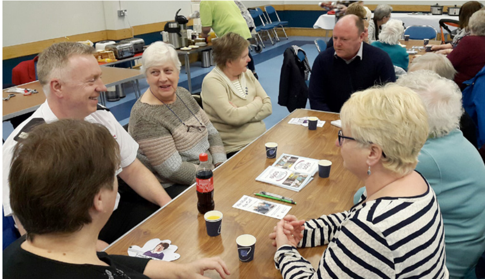
Some of the older people chat to police and representatives about community safety.