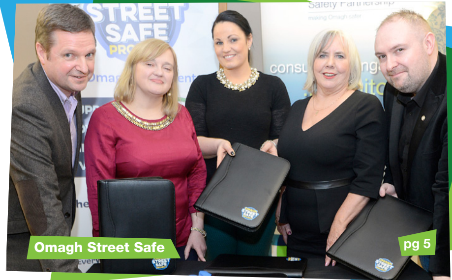
Omagh Street Safe