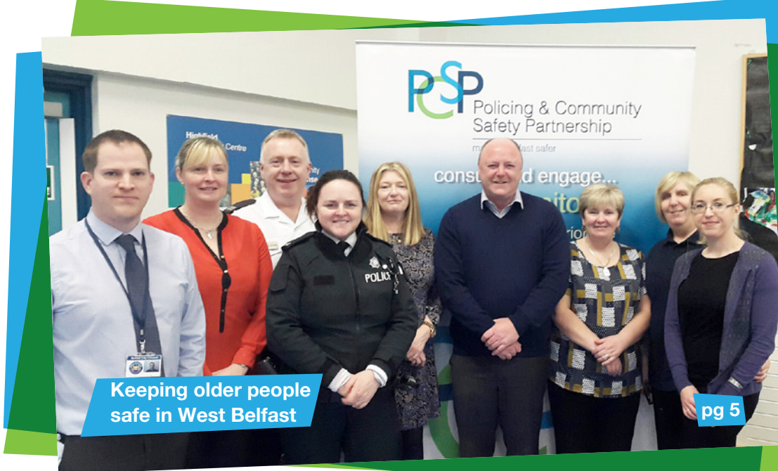
Keeping older people safe in West Belfast