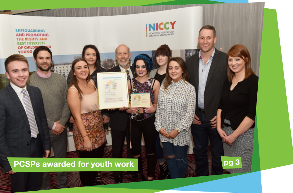
PCSPs awarded for youth work