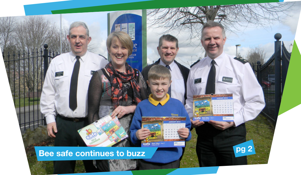
Bee safe continues to buzz