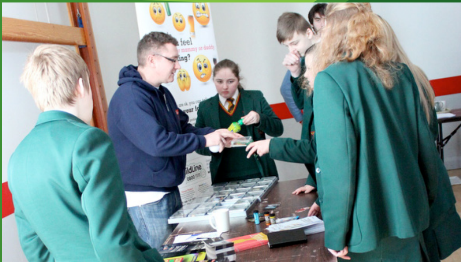
Some of the young people hear more about the drugs programme in Limavady.