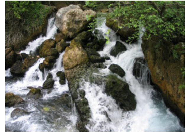
Fontaine de Vaucluse

We will explore sites such as Abbaye de Senanque, Fontaine de Vaucluse, Lagnes, Lioux, Murs and Saignon. The workshop will also include a one-day excursion to Arles and St. Remy which have a special historic connection to Vincent Van Gogh. Both locations will give us a unique opportunity to view the landscapes and sceneries that inspired so many of Van Gogh's masterpieces.