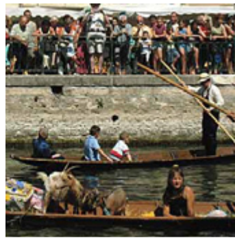
Floating market on the canal