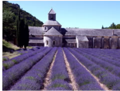
Abbaye de Senanque - Gordes

Luberon regions of Provence. With its canals, bridges, floating markets, antique shops, fishing business and unique aquatic presence, Isle-Sur-La-Sorgue will no doubt enchant you.