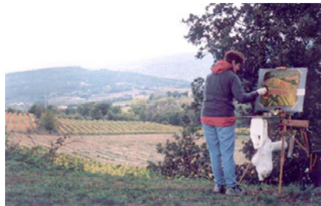
Painting on location

Accommodations at the hotel Les Nevons are modern and efficient with an eager to please staff. Moreover the hotel is centrally located and within an easy stroll to the many sidewalk cafes, restaurants and shops. (Single and double occupancy rooms available).