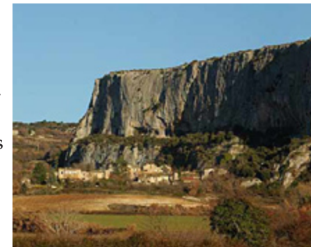
The cliffs above Lioux

We will explore sites such as Abbaye de Senanque, Fontaine de Vaucluse, Lagnes, Lioux, Murs and Saignon. The workshop will also include a one-day excursion to Arles and St. Remy which have a special historic connection to Vincent Van Gogh. Both locations will give us a unique opportunity to view the landscapes and sceneries that inspired so many of Van Gogh's masterpieces.