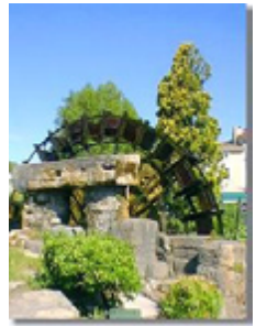
Waterwheel in Isle-Sur-La-Sorgue

While there will be time to also explore the more famous villages of the area and return to some favorite sites from previous trips, this workshop will concentrate on new sites and remote villages in the Luberon back country.