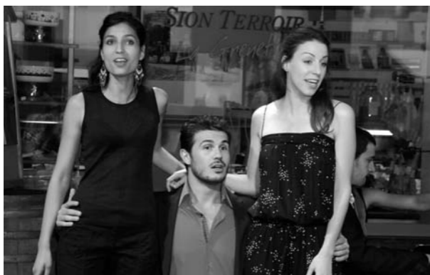
Participants' concert, Summer 2012

International prizes in München, Geneva, Paris, USA and the Maurice André Competition. Firstly former Principal of the Lausanne Chamber Orchestra and now Principal Trumpet of the Bern Symphony Orchestra. Professor in the HEMU of Lausanne.