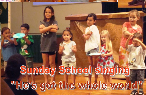
Sunday School singing "He's got the whole world"