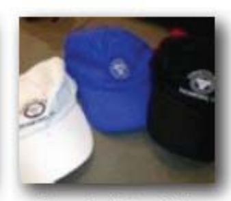
Baseball Cap $15