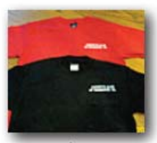
T-Shirt $16 (S-XL) $17, $18 (2X, 3X)