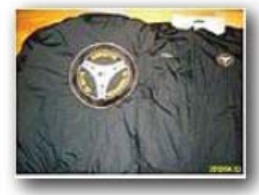
Jackets $113 S, M, L, XL (2XL-4XL extra$) (Order Item)