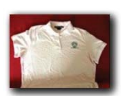
Polo Shirt $40 (Order Item)