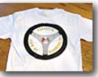
Logo on back of T-shirt