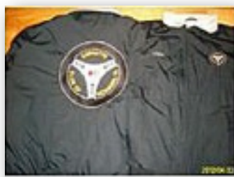
Jackets $113 S, M, L, XL (2XL-4XL extra$) (Order Item)