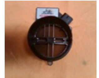
C5 Mass Air Flow Sensor $175