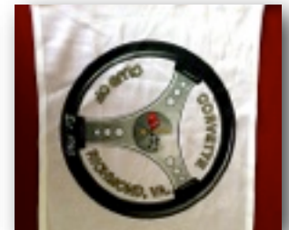
Flag 1 for $13 2 for $25