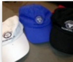
Baseball Cap $15