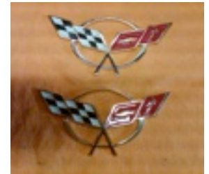
Gold C5 Emblems $150