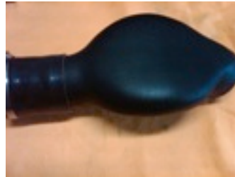
C5 Air Duct Bridge $50