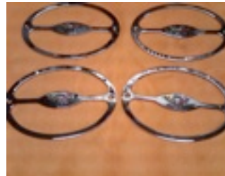
Chrome Tail light covers $95