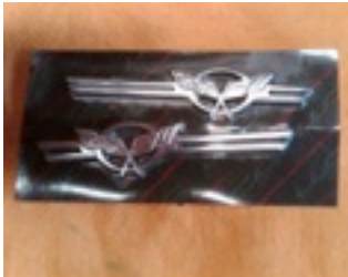
C5 Chrome Billet Badges $50

Here is what is currently for sale by members. For inquiries, please contact the member listed.