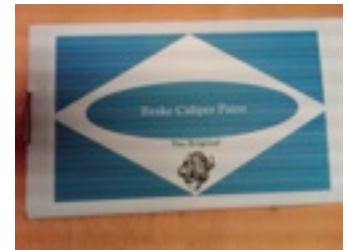
Caliper Paint Red $35