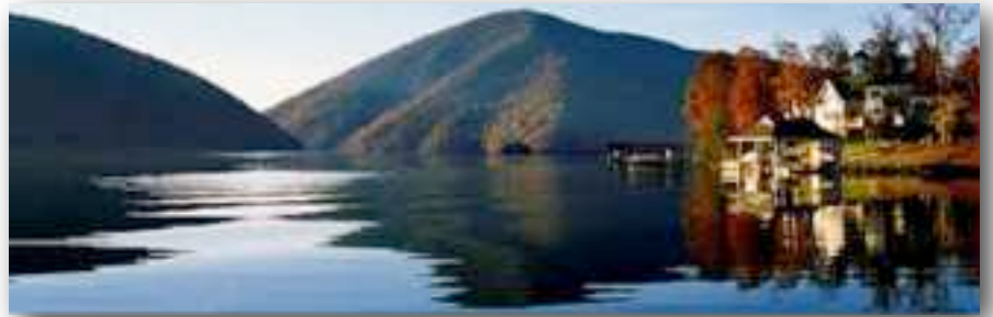
Smith Mountain Lake with Fall Foliage

Please join CCR on a cruise to scenic Smith Mountain Lake for a weekend of fun and fellowship. We hope to view beautiful fall foliage on this excursion. We encourage you to participate in everything we are planning, but you are welcome to choose any of activities that appeal to you.