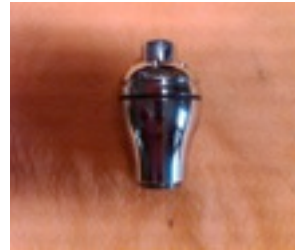
C5 Chrome Gear Shift Knob $75