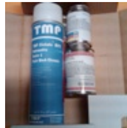
Caliper Paint Box (open) $35