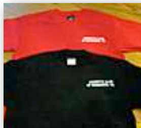
T-Shirt $16 (S-XL) $17, $18 (2X, 3X)