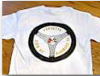
Logo on back of T-shirt