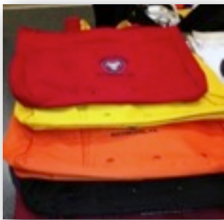
Tote Bag $20