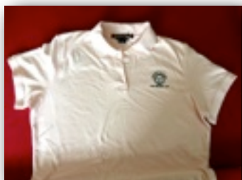
Polo Shirt $40 (Order Item)