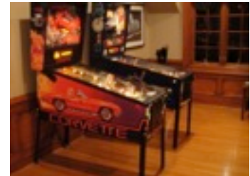
Corvette Pinball Machine $3,200