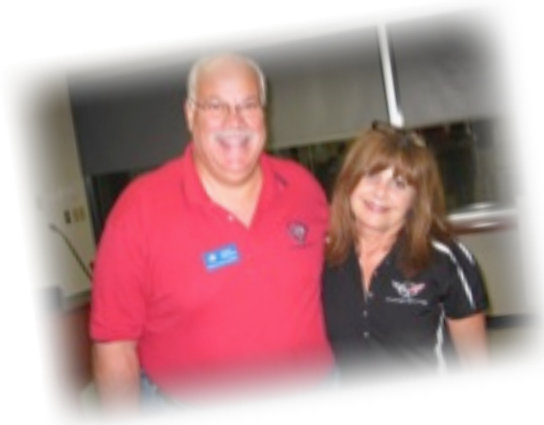
$5 Handshake: Mary Wells