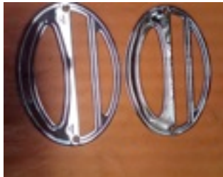
C5 outside tail light cover $50