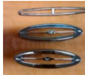
C5 side and tail light cover $50