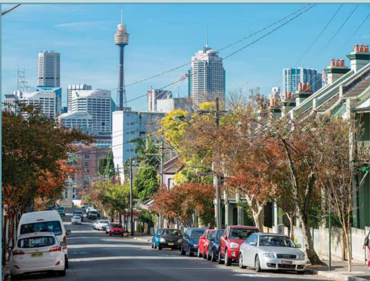
MINUTES TO SYDNEY CBD