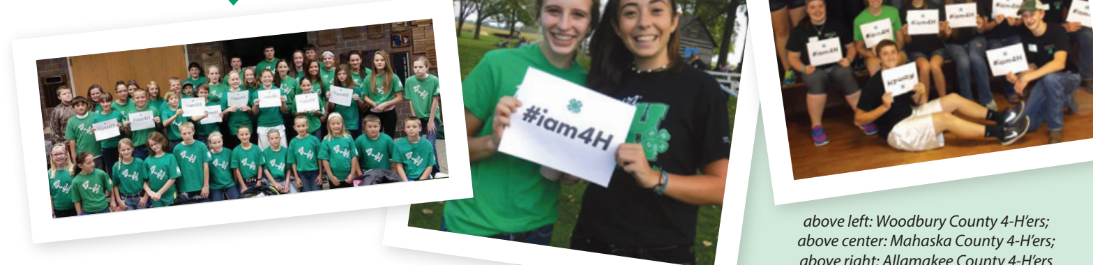
above left: Woodbury County 4-H'ers; above center: Mahaska County 4-H'ers; above right: Allamakee County 4-H'ers