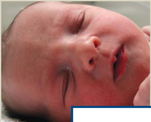
Birth of a child