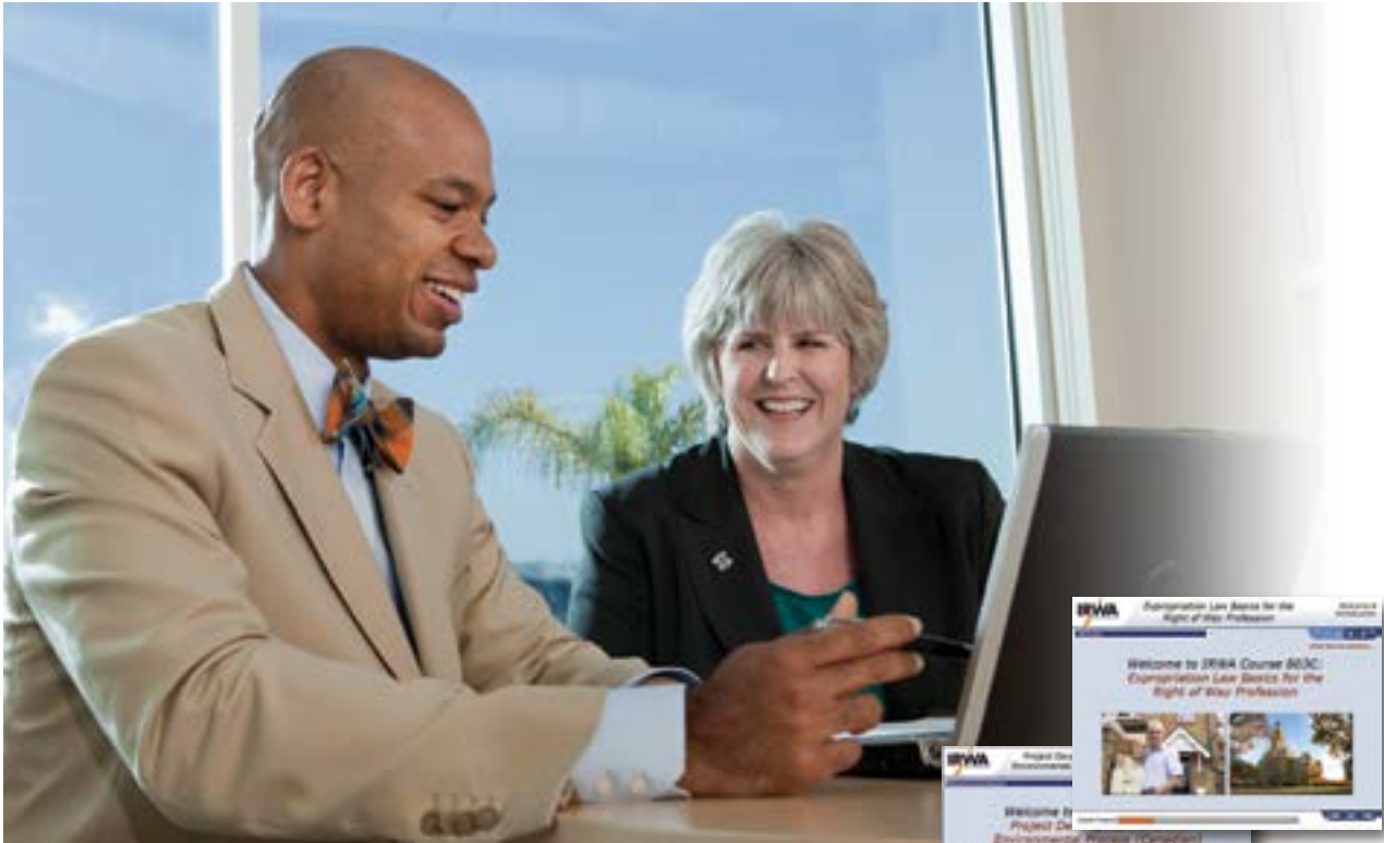
Actual IRWA members