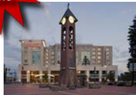
Hilton Hotel Vancouver, WA 301 W 6th St, Vancouver, WA 98660 (360) 993-4500 Conf. Code: Right of Way $137.00/ Night

Name: _____ Designation/Certification _____