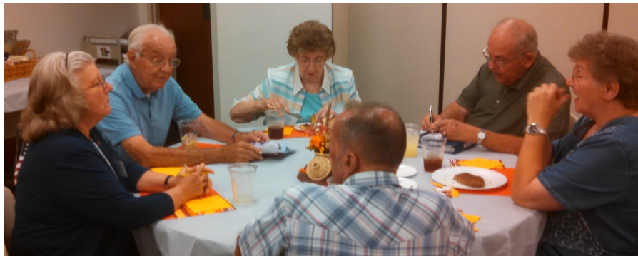
Annual Dinner and Meeting took place in September 38 attended the dinner and meeting