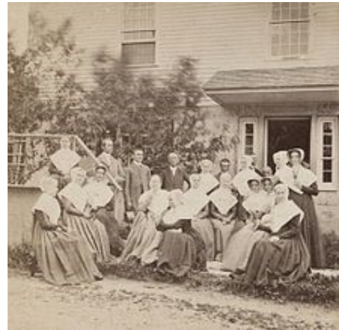
Group of Shakers