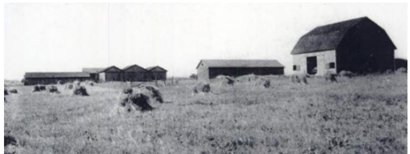
Union Village Shaker Farm in 1916

(A Cincinnati news article of 1811 reported that over a hundred families of Shakers from southwest Adams and southeast Brown counties floated past Cincinnati en route to form a Shaker village on the Wabash River in Indiana.)