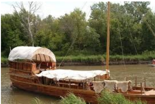
Typical Keelboat in early 1800's