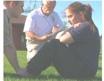
Photos by Justin Atkinson – Producer - South Washington County Telecommunications Commission - Cottage Grove, Minnesota

The Explorer lies on a flat surface with knees flexed and feet approximately twelve (12) inches from their buttocks. Another Explorer assists by anchoring their feet to the ground. The arms are held flat across the chest, with the hands placed on opposite shoulders. The Explorer raises their trunk, keeping the arms in position, curling up to touch the elbows to the thighs and then lowers back to the ground so that the shoulder blades (upper back) touch the ground. The Advisor records the number of curl-ups performed in one minute.