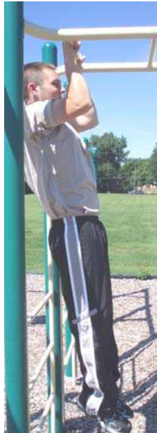
St. Paul Park