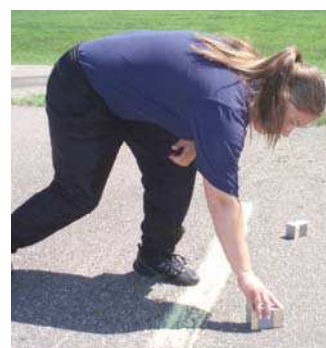
St. Paul Park, Minnesota