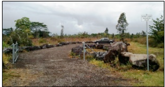
Newly opened parking lot (Photo 9/4/12)

Email or call Deborah Chang at: hkulaiwi@yahoo.com ; 776-1516