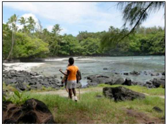
Kea‘au Beach (aka Hī‘ena Beach)

Mahalo to the Hawai‘i Tourism Authority for a grant helping make the Puna Trail Project possible!