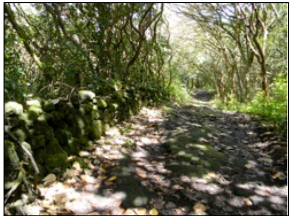
Section of Puna Trail