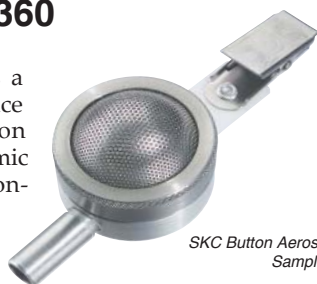
SKC Button Aerosol Sampler

The patented* SKC Button Aerosol Sampler is a reusable filter sampler with a porous curved-surface sampling inlet designed to improve the collection characteristics of inhalable dust (<100 \mu\text{m} aerodynamic diameter † ) including bioaerosols for viable or non-viable analysis.