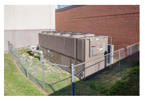
Additional photos can be found at this <u>link</u>. Thank you for supporting this project. It certainly is value-added for us. We will be having an open house and our regular