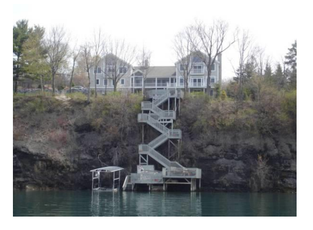
September 23 and 24, 2015