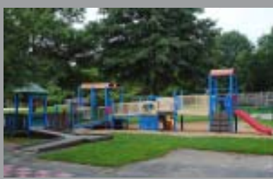
Merry Place Train Station