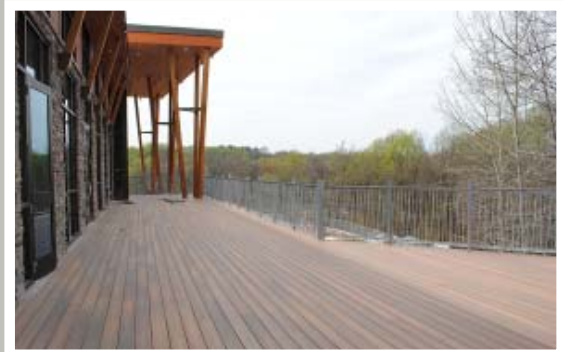
The Upper Deck at the CREC overlooks the North Brook woods and the Blue Route.

The fees and times for classes in the wellness rooms are listed in the Health and Wellness section found in pages 14 and 15.