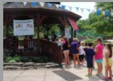
Gazebo at Life. Be In It. Day