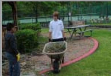
Volunteer Clean up

You and your family are welcome to help spruce up Merry Place. Bring a shovel, rake, clippers or just a helping spirit and join other volunteers at Merry Place on Saturday, May 12th from 9-10:30am.