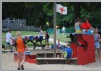
Sand box fun