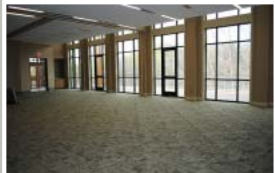
The multi-use room will be available to rent.