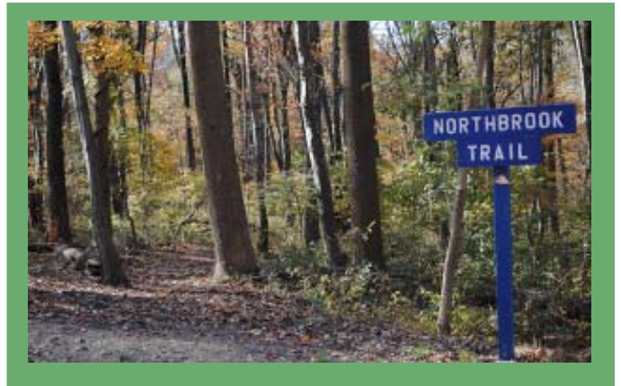
Please help keep the trails clean.

If you would like to help with the Dog Park improvements contact Eileen Mottola at emottola@haverfordtownship.org . Dog Park rules are posted at the entrance.