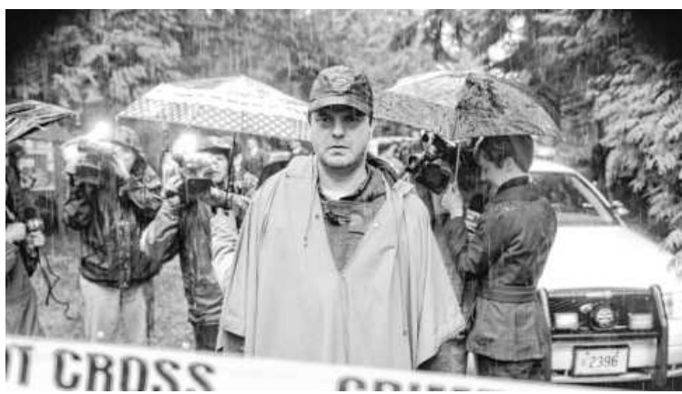
SERGEI BACHLAKOV, FOX

Unfortunately, rather than draw us in to the character, Wilson pushes us away. The performance isn't just charmless; it's overly defined and over-emphatic. There are many moments when you feel you're watching an actor make choices rather than watching a character simply be.