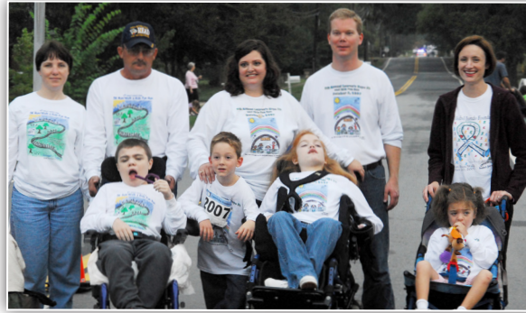
Meet children affected by Sanfilippo in South Carolina.