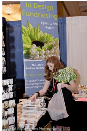
2011 Conference photos

Vendor show with a twist! At the vendor show we will have a demonstration stage that will be active throughout the day. Although our schedule isn't quite firm yet, the stage area will be a day full of education, information and FUN. During your shopping at the vendor show, you can come to the stage area for the activity (Fashion show, Price is Right Games, etc.) and then return to shopping without ever having to leave the vendor show area. We will have a day full of education mixed in with shopping!