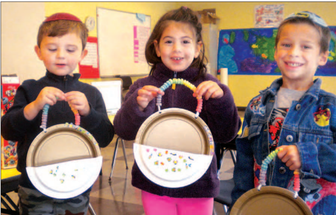
Some happy attendees of our October Pre-School Workshop for children 3 and 4 years old. The program takes place once a month on Sundays from 11:00 am to 12:00 noon. Contact Rena Casser for more information.