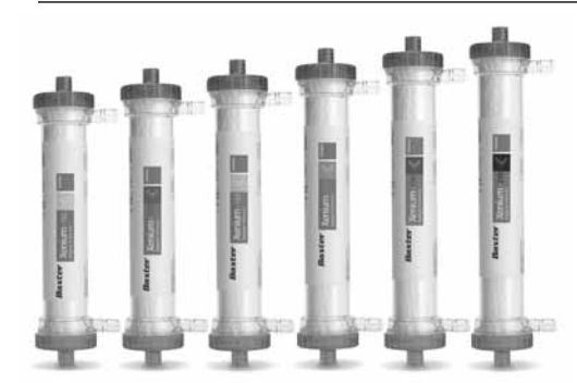
XENIUM Dialyzers, High Flux, Synthetic