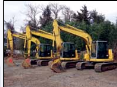
(3) OF (5) KOMATSU PC128US-2