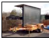
(1) OF (7) MESSAGE BOARDS

JD 215 2-Gang Tow Behind Disc Harrow, s/n A00215F013334, 14"x22" discs and transport wheels. In good condition with good tires.