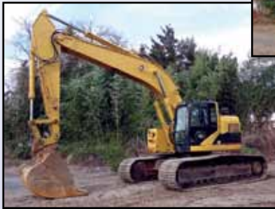
'06 CAT 325C LCR

2006 CATERPILLAR 325C LCR , s/n BKW00414, Cat 3126 dsl, 10'6" dipper stick, hydraulic beyond, Cat hydraulic quick coupler, 48" digging bucket, enclosed cab with ac, 16'6" crawlers, and 33.5" TBG pads. In good condition with good undercarriage.