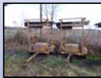
(2) CONSAM RADAR BOARDS