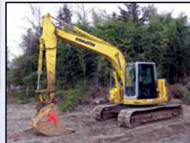
'00 KOMATSU PC128US-2

2004 KOMATSU PC78US-6N0 , s/n 6646, dsl, 6'3" dipper stick, JRB hydraulic quick coupler, hydraulic beyond, 20" digging bucket, backfill blade, enclosed cab with ac, 9'4" crawlers, and 18" street pads. In good condition with good undercarriage.