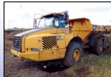
'04 VOLVO A35D

2004 VOLVO A35D, 35 Ton 6x6 , s/n A35DV71283, Volvo dsl, powershift trans, heated dump body, tailgate, enclosed cab with ac, and 26.5R25 tires. In good condition with fair to good tires.