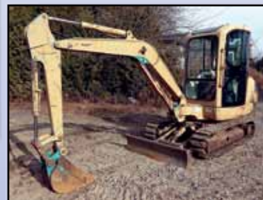
(1) OF (2) '99 KOMATSU PC35R-8

(2) 1999 KOMATSU PC35R-8 Minis , s/n 37653, s/n 37524, dsl, 4'5" dipper sticks, hydraulic beyond, digging buckets, backfill blades, enclosed cabs, 7' crawlers and 12" street pads. In fair and fair to good condition with fair to good and fair undercarriages.