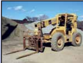
IR VR-90B 9,000#

(4) 1999-1997 INGERSOLL-RAND VR-90B, 9,000# 4x4, s/n 155210, s/n 152885, s/n 147321, s/n 148807A, Cummins dsl, powershift trans, 3-section hydraulic booms, 37' lift height, forks, 4-wheel steer, ROPS canopies, and 13.00-24 tires. In good condition with good to very good and good tires.