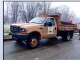
'99 FORD F-450XL

(3) 2000-1999 FORD F-450XL Super Duty, Triton V-10 gas, auto trans, 9' steel dump bodies with (2) with manual tarps, dual rear wheels, and 225/70R19.5 tires. In good and fair to good condition with good tires.