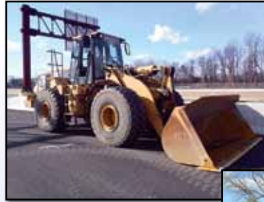
'02 CAT 966G

(3) 2001-1999 CATERPILLAR 950G , s/n 3JW02226, s/n 3JW01125, s/n 3JW00805, Cat 3126 dsl, powershift trans, hydraulic side dump buckets, fork attachments, hydraulic quick couplers, auxiliary hydraulics, EROPS with ac, and 23.5R25 tires. In good condition with good to very good, good, and fair to good tires.