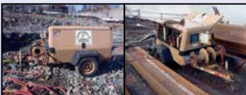
(1) OF (13) IR 185CFM