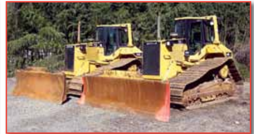
(2) OF (6) CRAWLER TRACTORS