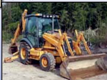
'01 CASE 580SM

2001 CASE 580 Super M , s/n JJG0279188, Case 3.9L dsl, shuttle trans, general purpose loader bucket, 24" digging bucket, EROPS, 12-16.5 front and 19.5L-24 rear tires. In good condition with fair to good tires.