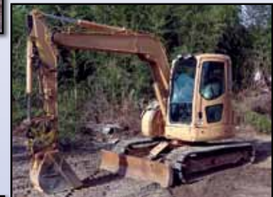
'04 KOMATSU PC78US-6N0

2004 KOMATSU PC78US-6N0 , s/n 6646, dsl, 6'3" dipper stick, JRB hydraulic quick coupler, hydraulic beyond, 20" digging bucket, backfill blade, enclosed cab with ac, 9'4" crawlers, and 18" street pads. In good condition with good undercarriage.