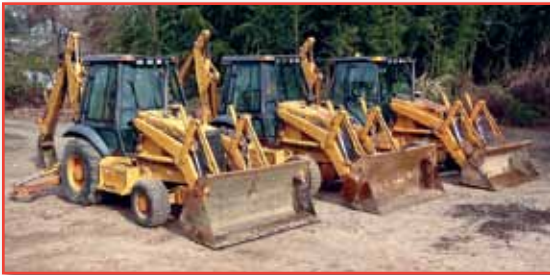
(3) OF (7) 4X4 EXTEND-A-HOES

WEDNESDAY, APRIL 18, 2012 - 9:00AM Hackensack, New Jersey (Newark/NYC Area)