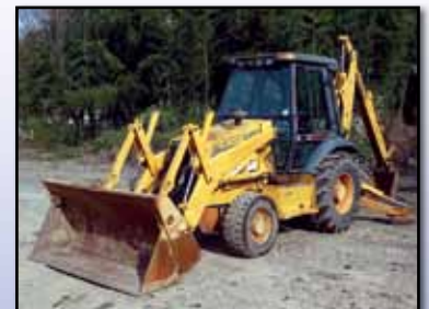
'98 CASE 580SL SERIES II

1996 CASE 580 Super L , s/n JJG0198140, 3.9L dsl, shuttle trans, hydraulic 4 in 1 loader bucket, 24" digging bucket, EROPS, 12-16.5 front and 19.5-24 rear tires. In good condition with poor tires.