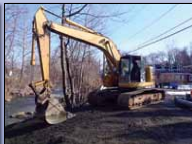
'02 KOMATSU PC228USLC-3

(4) 2003-2000 KOMATSU PC228USLC-2 , s/n 15558, s/n 15867, s/n 15809, s/n 15471, Komatsu dsl, 9'6" dipper sticks, JRB hydraulic quick couplers, (1) with hydraulic beyond, digging bucket, zero tail swing, enclosed cabs with ac, 14'7" crawlers, and 27.5" TBG pads. In good condition with good and fair to good undercarriages.