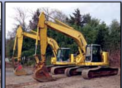
(2) OF (7) KOMATSU PC228USLC