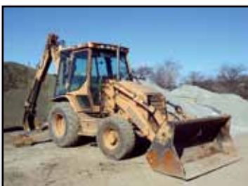
'03 CAT 420DIT

24" Hydraulic Milling Attachment (Fits Gehl SL5625)