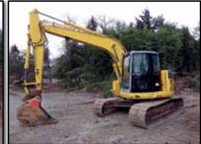
'01 KOMATSU PC128US-2