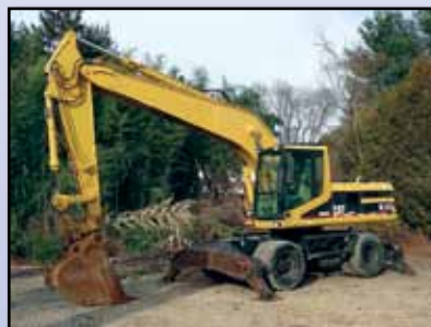
'01 CAT M320

2001 CATERPILLAR M320 Rubber Tired Excavator , s/n 6WL00725, Cat 3116T dsl, hydrostatic trans, 9' dipper stick, JRB hydraulic quick coupler, hydraulic beyond, digging bucket, EROPS with ac, and (4) hydraulic outriggers. In good condition with fair tires.