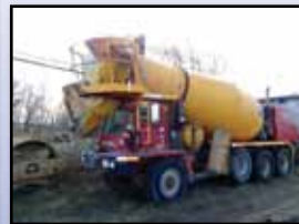
(1) OF (4) '97 OSHKOSH 11 CU YD

(4) 1997 OSHKOSH S-2146 Tri-Axle Front Discharge , Cat 3306 dsl, auto trans, Oshkosh 11 cubic yard front discharge mixers, s/n L5A-4151, s/n 1586, s/n N1754, s/n unknown, 200 gallon water tank, 46,000# rears, 21,000# front front and 20,000# airlift 3rd axle, aluminum wheels, and 445/65R225 tires. In fair to good condition with fair to very good tires.