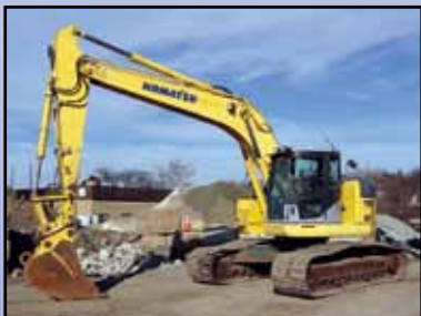
'04 KOMATSU PC228USLC-3

(1) 2004 & (2) 2002 KOMATSU PC228USLC-3 , s/n 30534, s/n 21013, s/n 20925, Komatsu dsl, 9'6" dipper sticks, JRB hydraulic quick couplers, (2) with hydraulic beyond, digging buckets, zero tail swing, enclosed cabs with ac, 14'7" crawlers, and 31.5" TBG pads. All in good condition with good undercarriages.