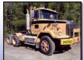
'94 AUTOCAR ACL64B

1988 WILSON 4360T T/A Folding Deck Trailer, 8'x8' upper deck, 33" transition from upper deck to lower deck, 25'6" lower deck, 7' rear folding deck, 5' removable ramps from upper deck to lower deck, Braden hydraulic winch, 73,500# GVWR, 16,950# GAWR each, chain dogs, and 10R17.5 tires. In fair condition with good tires.