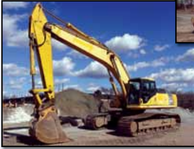
'06 KOMATSU PC400LC-7L

2006 KOMATSU PC400LC-7L , s/n A86743, Komatsu dsl, heavy duty undercarriage, 11' dipper stick, hydraulic beyond, JRB hydraulic quick coupler, digging bucket, enclosed cab with ac, 177" crawlers, and 35.5" TBG pads. In good condition with good undercarriage.