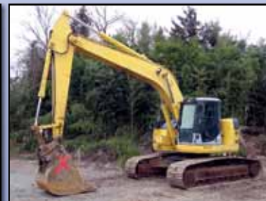
'02 KOMATSU PC228USLC-3

(2) 1999 KOMATSU PC35R-8 Minis , s/n 37653, s/n 37524, dsl, 4'5" dipper sticks, hydraulic beyond, digging buckets, backfill blades, enclosed cabs, 7' crawlers and 12" street pads. In fair and fair to good condition with fair to good and fair undercarriages.