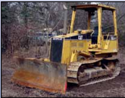
'95 CAT D3CXL SERIES III

1995 CATERPILLAR D3CXL Series III , s/n 6SL01090, Cat 3046 dsl, powershift trans, 6-way straight blade, tow hitch, ROPS canopy, and 16" SBG pads. In good condition with good undercarriage.