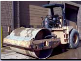
'96 IR SD-1000

(4) 1998-1994 INGERSOLL-RAND SD-1000, s/n 152840, s/n 145513, s/n 10651, s/n 140365, Cummins dsl, 84" smooth drums, drum and wheel drive, (2) with 2-spd vibration, ROPS canopies, and 23.1-26 tires. In good condition with good and fair tires.