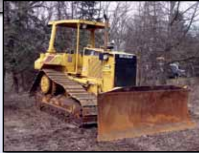
'00 CAT D6MXL

1998 CATERPILLAR D5M XL , s/n 6GN01044, Cat 3116 dsl, powershift trans, 6-way straight blade, differential steer, drawbar, ROPS canopy, and 22" SBG pads. In good condition with good undercarriage.