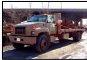
(1) OF (2) GMC C6500

1995 FORD F-800 S/A Flatbed/Dump , Ford dsl, 6 spd trans, 16' steel flatbed body, 17,500# rear and 7,000# front axles, and 10R22.5 tires. In good condition with good tires.