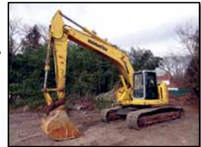
'00 KOMATSU PC228USLC-2

(4) 2003-2000 KOMATSU PC228USLC-2 , s/n 15558, s/n 15867, s/n 15809, s/n 15471, Komatsu dsl, 9'6" dipper sticks, JRB hydraulic quick couplers, (1) with hydraulic beyond, digging bucket, zero tail swing, enclosed cabs with ac, 14'7" crawlers, and 27.5" TBG pads. In good condition with good and fair to good undercarriages.