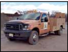
'03 FORD F-550XL

2003 FORD F-550XL Super Duty S/A Service Truck , Powerstroke dsl, auto trans, Reading 11' service body, 50 gallon fuel tank, 12 volt pump, hose reel, tow package, ac, dual rear wheels, and 225/70R19.5 tires. In fair to good condition with fair to good tires.