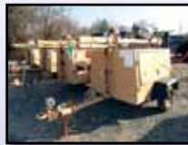
IR L64MH LIGHT TOWERS