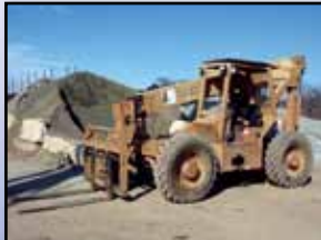
IR VR-90B 9,000#