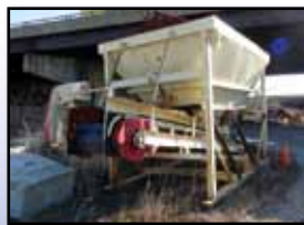
'07 EXCEL 36SBF

2007 SMALIS 24"x60' Truss Conveyor, s/n 246024-132, Baldor 10HP electric motor and Dodge gear reducer, 24" truss. In good condition.