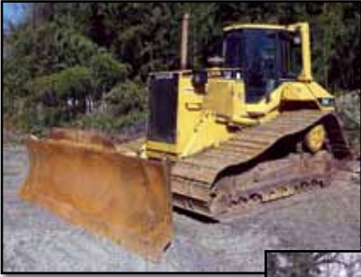
'01 CAT D6M LGP

2000 CATERPILLAR D6M XL , s/n 3WN02004, Cat 3116 dsl, powershift trans, 6-way straight blade, drawbar, fingertip controls, ROPS canopy, and 24" SBG pads. In good condition with good undercarriage.