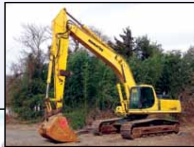
'03 KOMATSU PC400HD-6LM

2003 KOMATSU PC400HD-6LM , s/n A85028, Komatsu dsl, 15'10" dipper stick, hydraulic beyond, JRB hydraulic quick coupler, 60" digging bucket, enclosed cab with ac, 177" crawlers, and 31.5" TBG pads. In good condition with good undercarriage.