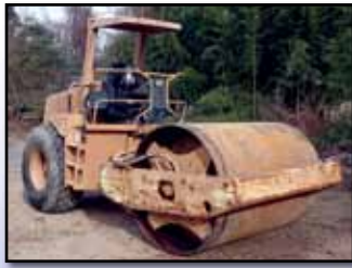
'94 IR SD-1000

(4) 1998-1994 INGERSOLL-RAND SD-1000, s/n 152840, s/n 145513, s/n 10651, s/n 140365, Cummins dsl, 84" smooth drums, drum and wheel drive, (2) with 2-spd vibration, ROPS canopies, and 23.1-26 tires. In good condition with good and fair tires.