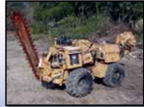
'96 VERMEER LM42

1996 VERMEER LM42 Articulated Trencher/Cable Plow, s/n 1VRM112L3T1000536, Deutz dsl, hydrostatic trans, 5' trencher bar, cable plow, and 26x12.00-12 tires. In good condition with good tires.