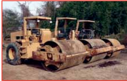
(3) OF (4) IR SD-1000