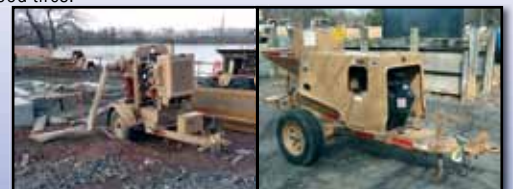
'98 GODWIN 6 INCH