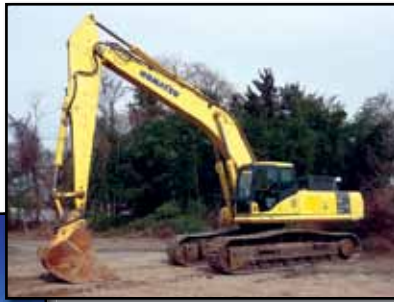
'06 KOMATSU PC400LC-7E0

2006 KOMATSU PC400LC-7E0 , s/n A87307, Komatsu dsl, heavy duty undercarriage, 15'10" dipper stick, JRB hydraulic quick coupler, 60" digging bucket, enclosed cab with ac, 177" crawlers, and 35.5" TBG pads. In good condition with good undercarriage.