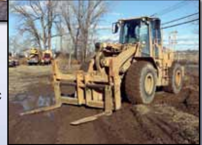
'01 CAT 950G

(2) 2002 & 2001 CATERPILLAR 966G , s/n 3SW01614, s/n 3SW01048, Cat 3306 dsl, powershift trans, Cat hydraulic side dump buckets, fork attachments, Cat hydraulic quick couplers, auxiliary hydraulics, EROPS with ac, and 26.5R25 tires. In good condition with good tires.