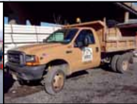
'99 FORD F-450XL

1999 FORD F-450 Super Duty, Powerstroke V-8 dsl, auto trans, 11' steel dump body with manual tarp, tow package, ac, dual rear wheels, and 225/70R19.5 tires. In good condition with good tires.