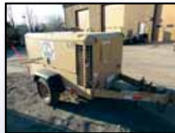
'98 IR 375CFM

(13) 2000-1998 INGERSOLL-RAND P185WJD, 185CFM Portable Air Compressors , JD dsl, front mounted hose reels and 205/75R15 tires. In good condition with good tires.