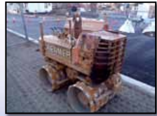
(1) OF (5) TRENCH COMPACTORS

(4) 1999-1994 RAMMAX & MULTIQUIP RW1403 Trench Compactor, s/n 328107F, s/n 32574F, s/n 321478, s/n 315341, dsl, hydrostatic trans, 33" and 24" split padfoot drums and drum cleaners. In good and fair to good condition. 1987 RAMMAX P33/24 Trench Compactor, s/n 5138, dsl, hydrostatic trans, 24" split padfoot drums. In fair to good condition.