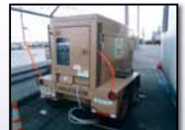
'06 IR G80

1996 SCHWING P-88 Portable Concrete Pump , s/n 171088562, Wisconsin gas, 961PSI and 225/75R15 tires. In good condition with good tires.