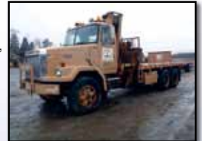
'89 AUTOCAR WITH IMC 20,000#

1989 GM/WHITE/AUTOCAR ACL64B T/A Knuckleboom , Cat 3406 dsl, Eaton Fuller 8LL, 10 spd trans, IMC 18000, 20,000# knuckleboom, s/n 18026886009, 9'-25'10" 4-section hydraulic boom, 35'1" lift height, (2) hydraulic outriggers, 20' steel flatbed, underbody toolboxes, 2-stage engine brake, Hendrickson suspension, ac, 12.00R24 front and 11.00R24 rear tires. In good condition with good tires.