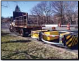
(1) OF (2) '93 GMC TOPKICK WITH SCORPION

controls, 12'4" stake body, behind cab (2) 32" man baskets, ac, and 11R22.5 tires. In good condition with good tires.