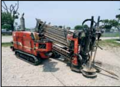
00 DITCH WITCH JT2720

2000 DITCH WITCH JT2720 , s/n J2T2209, JD dsl, (370') drill stem, auto stake down, fluid system, and 12" rubber tracks. In good condition with good undercarriage.