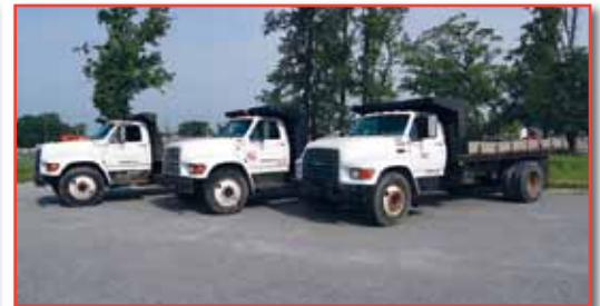
FORD F-800 FLAT DUMPS