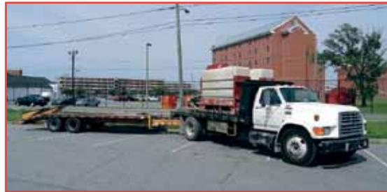
FORD F-700 FLUID MIXING WITH 6 TON TAG TRAILER