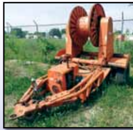
SINGLE DRUM PULLER

(2) CONDUX Fiber Optic Pullers, 30"x6" bull wheel, Briggs & Stratton 18HP gas, mounted on single axle trailer • CONDUX Fiber Optic Puller (Parts) • Single Drum Puller, Wisconsin gas • (4) CORNING SIECOR M90/Series 6000 Fusion Splicers • SIECOR 340 OTDR Plus Multi-Tester II • (2) AGILENT Wirescope 350 Cable Certifiers • Cable Pulling Guides and Stringing Blocks • Splicing Material, Tools, and Accessories