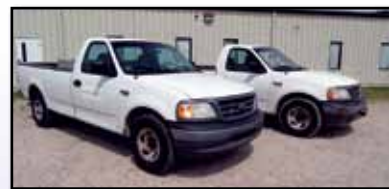
(2) OF (5) FORD F-150

(2) 2001 FORD F-150XL Pickup Trucks, 4.2L, V-6 gas and auto trans, 8' bed with liner, a.c. In fair to good condition with fair to good tires.