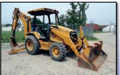
00 CAT 416C 4X4 EXTEND-A-HOE

2000 CATERPILLAR 416C, 4x4 Extend-A-Hoe , s/n 4ZN19777, dsl and shuttle trans, GP loader bucket, 16" digging bucket, ROPS canopy. In fair to good condition with fair front and poor rear tires.