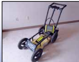
NOGGIN SMART CART GPR

(2) 4" Piercing Tools • (5) 3" Piercing Tools • (2) 2" Piercing Tools • (4) Duct Rodders