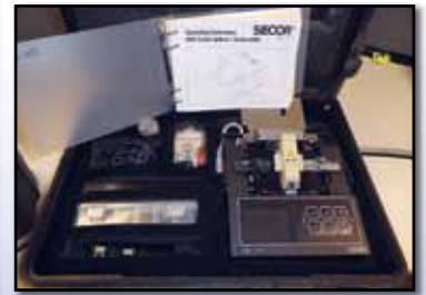
FIBER OPTIC SPLICERS

(2) CONDUX Fiber Optic Pullers, 30"x6" bull wheel, Briggs & Stratton 18HP gas, mounted on single axle trailer • CONDUX Fiber Optic Puller (Parts) • Single Drum Puller, Wisconsin gas • (4) CORNING SIECOR M90/Series 6000 Fusion Splicers • SIECOR 340 OTDR Plus Multi-Tester II • (2) AGILENT Wirescope 350 Cable Certifiers • Cable Pulling Guides and Stringing Blocks • Splicing Material, Tools, and Accessories