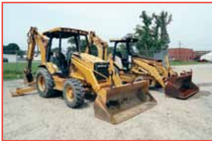
'00 CAT 416C AND '96 CAT 416B