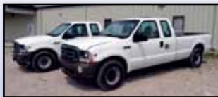
'02 FORD F-250 EXTENDED CABS

1999 FORD F-250XLT SD Extended Cab Utility Truck, Powerstroke 7.3L dsl and auto trans, Reading 8'6" utility body with ladder rack, IR gas powered air compressor with hose reel, cc, pw, pl, a.c. In fair to good condition with fair to good tires.