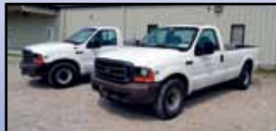
(2) OF (3) '00 FORD F-250

(3) 2000 FORD F-250XL SD Pickup Trucks, Triton 5.4L, V-8 gas and auto trans, 8' bed with liner and cross toolbox, a.c. In good condition with good to very good tires.