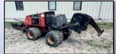
95 DITCH WITCH 410SXDD