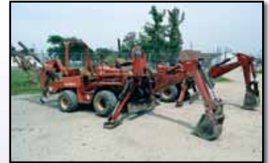
00 AND 96 DITCH WITCH 5110DD

1988 DITCH WITCH 4010DD Vibratory Cable Plow/Backhoe , s/n 6E0871, Deutz dsl, A321 backhoe attachment, A430 vibratory cable plow, 64" backfill blade, roll-bar. In fair condition with poor tires.