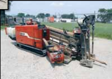
00 DITCH WITCH JT920L

1998 DITCH WITCH JT920E , s/n 2R3392, Lister dsl, auto stake down, fluid system, and 10" rubber tracks. (Not Running-Hydraulic Hoses Disconnected)