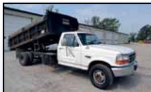
'97 FORD F-450 MASON DUMP

1997 FORD F-450 SD Mason Dump Truck, Powerstroke 7.3L dsl and 5 speed trans, Ox 14' dump body, tow package, dual rear wheels, a.c. In fair to good condition with good tires.