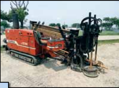
00 DITCH WITCH JT2720

2000 DITCH WITCH JT2720 , s/n 3J2T2704, Cummins dsl, (500') drill stem, auto stake down, fluid system, and 12" rubber tracks. In good condition with good undercarriage.