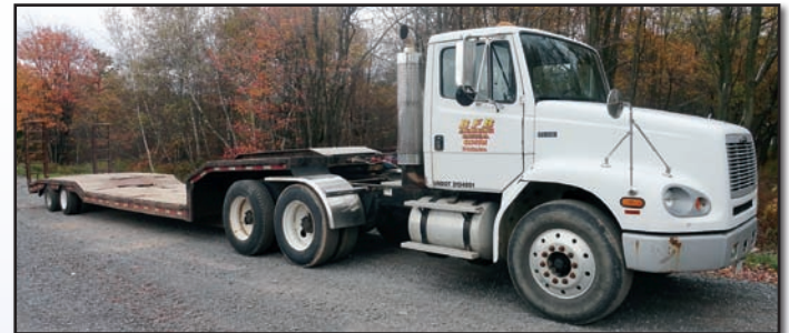
'99 FREIGHTLINER FL112 AND '89 WINSTON 35 TON

1999 FREIGHTLINER Model FL112 Tandem Axle Truck Tractor , powered by Cat C-12, 430HP diesel engine and Rockwell 10 speed transmission, equipped with 40,000# rears, 12,000# front axle, 2-stage Jake brake, air ride suspension, 14' wheelbase, single frame, air slide 5th wheel, aluminum front wheels, cruise control, heated mirrors, A/C, 52,000# GVWR, and 315/80R22.5 front and 11R24.5 rear tires. In good condition with good tires.