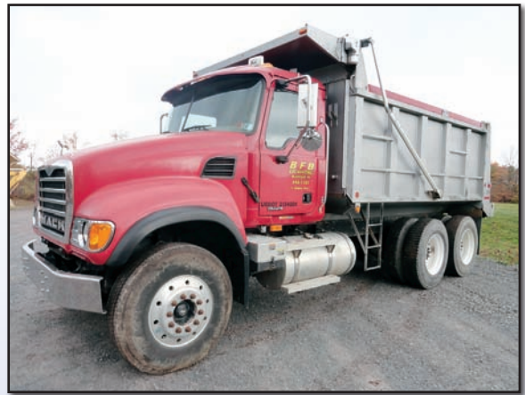
'04 MACK CV713 GRANITE

2006 MACK Model CV713 Granite Tri-Axle Dump Truck , powered by Mack E7, 427HP diesel engine and Maxitorque 10 speed transmission, equipped with Bibeau BFL-HD 17'6" heated steel dump with air gate, power tarp, 46,000# rears, 18,000# front, 20,000# lift axles, 2-stage Jake brake, camelback suspension, heated mirrors, aluminum wheels, and 11R24.5 tires. In good condition with very good tires. (131,644 Miles)