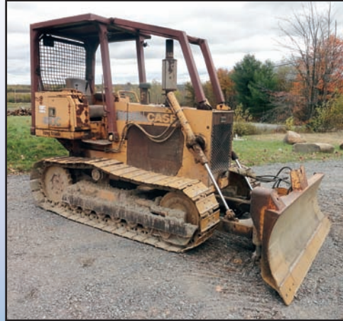
'89 CASE 450C LONG TRACK

1989 CASE Model 450C Long Track Crawler Tractor , s/n JAK0012930, powered by Case diesel engine and Hi-Lo reversing transmission, equipped with 6-way hydraulic straight blade, 16" SBG pads, and ROPS canopy with sweeps. In fair to good condition with good undercarriage.