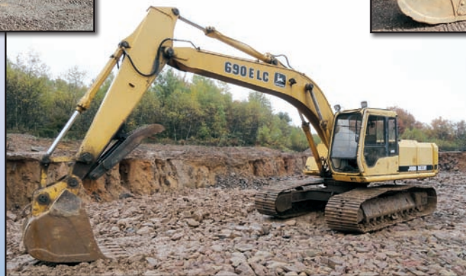
'94 JOHN DEERE 690E LC

2004 CASE Model CX130 Hydraulic Excavator , s/n DAC131496, powered by Case diesel engine and hydraulic drive, equipped with 10' stick with Geith 15" mechanical thumb, Geith 36" digging bucket, 23.5" TBG pads, 11'4" crawlers, and enclosed cab with A/C. In good condition with good tires. (4,563 Hours) (Less Than 300 Hours on New U/C Group)