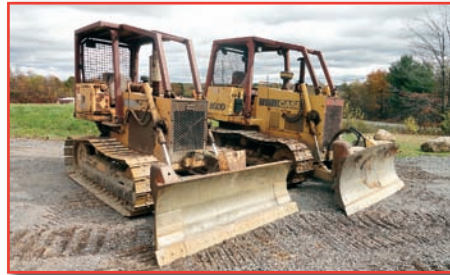
CASE 850D AND 450C