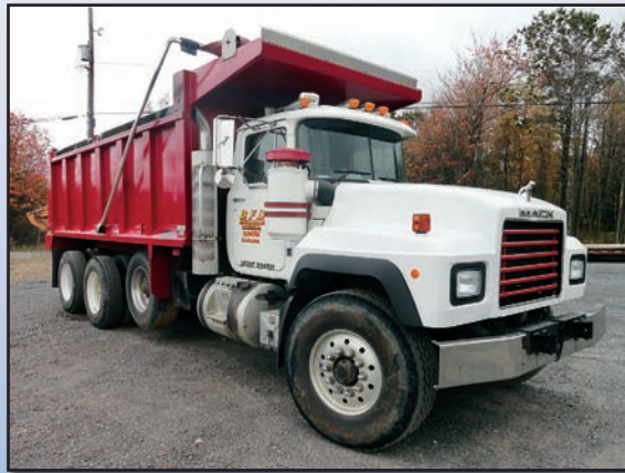
'00 MACK RD688S

2000 MACK Model RD688S Tri-Axle Dump Truck , powered by Mack E7, 427HP diesel engine and Eaton Fuller 8LL 10 speed transmission, equipped with BeauRoc 17'6" heated dump body with air gate, single chute and power tarp, 46,000# rears, 18,000# front, 20,000# lift axles, air operated central hydraulics, 2-stage Jake brake, camelback suspension, tow package with air, heated mirrors, A/C, aluminum front and lift wheels, and 425/65R22.5 front, 11R24.5 rear and 385/65R22.5 lift tires. In good condition with good tires.