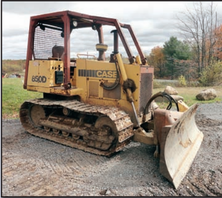
'86 CASE 850D

1989 CASE Model 450C Long Track Crawler Tractor , s/n JAK0012930, powered by Case diesel engine and Hi-Lo reversing transmission, equipped with 6-way hydraulic straight blade, 16" SBG pads, and ROPS canopy with sweeps. In fair to good condition with good undercarriage.