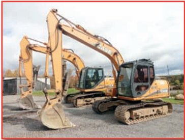
'07 CASE CX160B AND '04 CX130

THURSDAY, NOVEMBER 15, 2012 - 9:00AM Blakeslee, Pennsylvania (Pocono Mountains)