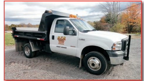
'05 FORD F-350 4X4