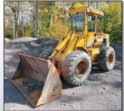
JOHN DEERE 544B

JOHN DEERE Model 544B Rubber Tired Loader , s/n 310618T, powered by John Deere diesel engine and powershift transmission, equipped with general purpose loader bucket, enclosed ROPS cab, and 17.5-25 tires. In fair to good condition with fair to good tires. (New Bucket Linkage & Pins, Line Bored)