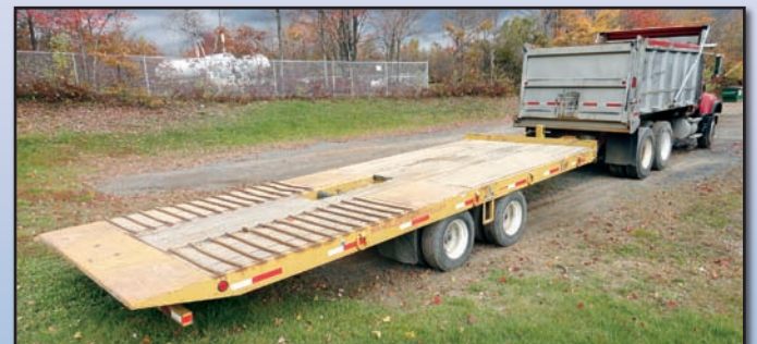
'08 SUPERLINE 22 TON TILT DECK

2008 SUPERLINE 22 Ton Tilt Deck Tag-A-Long Trailer , equipped with 24'x8'6" tilt deck, ratchet strap ties, D-ring chain dogs, air brakes, 53,300# GVWR, and 235/75R17.5 tires. In good condition with very good tires.