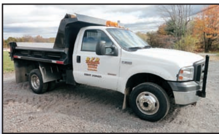
'05 FORD F-350XL SUPER DUTY 4X4

2005 FORD Model F350XL Super Duty 4x4 Mason Dump Truck , powered by Powerstroke 6.0L diesel engine and automatic transmission, equipped with Heil 9' steel mason dump body, Western 9'6" V-plow, central hydraulic system, dual rear wheels, A/C, and 245/75R17 tires. In good condition with excellent tires. (043,854 Miles)