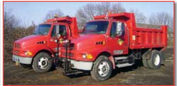
(2) '03 STERLING M7500