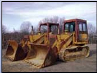
(2) 91 CASE 1155E

1991 CASE Model 1155E Crawler Loader , s/n JAK0009852, Case diesel and powershift trans, general purpose loader bucket with teeth, enclosed ROPS cab with heat, and 16" DBG pads. In fair to good condition with fair undercarriage.