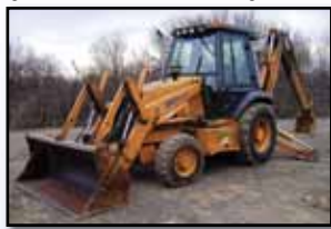
99 CASE 580 SUPER L 4X4 EXTEND-A-HOE

2002 CASE Model 580M, 4x4 Tractor Loader Extend-A-Hoe , s/n JGG0312897, Case diesel and shuttle trans, GP bucket, 36" digging bucket, enclosed ROPS cab, 12-16.5 front and 19.5L24 rear tires. In good condition with fair to good tires.