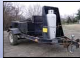
01 MARATHON KEB170

411689C40, 4 cylinder gas and Funk Revers-O-Matic trans, 40" split front drum, 18" rear steel wheels, and spray system. In good condition.