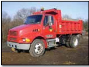
'03 STERLING M7500

2003 STERLING Model M7500 Acterra Single Axle Dump Truck , Cat 3126, 275HP diesel and Eaton Fuller Roadranger 9 speed trans, Thiele 10'6" steel dump body with 3 chutes, 21,000# rear axle and 12,000# front axle, central hydraulic system, tow package with air, spring suspension, air brakes, cruise control, air conditioning, and 11R22.5 tires. In good condition with good tires.