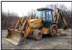
97 CASE 580 SUPER L 4X4 EXTEND-A-HOE