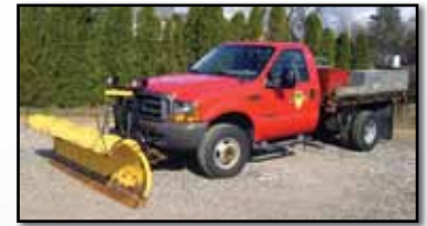
'01 FORD F-350 XL 4X4

2001 FORD Model F-350 XL Super Duty 4x4 Flatbed Truck , Powerstroke 7.3L diesel and 6 speed trans, Fisher 9' Minute Mount snowplow, 9'6" wooden flatbed with side boxes, cross box, dual rear wheels, tow package, and 235/85R16 tires. In good condition with very good tires.