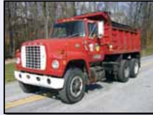
'82 FORD 8000

1982 FORD Model 8000 Tandem Axle Dump Truck , Cat 3208 (reman) diesel and Roadranger RT6613, 13 speed trans, 12'6" steel dump body with 14" asphalt apron, 44,000# rears and 16,000# front axle, spring beam suspension, 315/80R22.5 front and 10.00R20 rear tires. In fair to good condition with good tires.