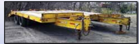
'71 & '73 GENERAL 18 TON

1999 TOWMASTER Model QT-10DD, 5 Ton Tag-A-Long Trailer , 16'6"x6'10" load deck with 5'6" ramps, electric brakes, chain dogs, and 225/75R15 tires. In good condition with good to very good tires.