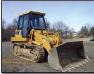
05 CAT 953C

1991 CASE Model 1155E Crawler Loader , s/n JAK0009815, Case diesel and powershift trans, general purpose loader bucket with teeth, ROPS canopy, and 16" DBG pads. In fair to good condition with fair to poor undercarriage.