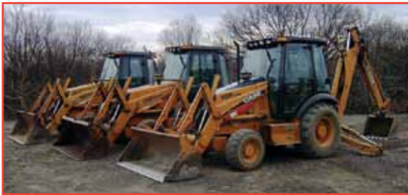
(3) OF (5) CASE 4X4 EXTEND-A-HOES