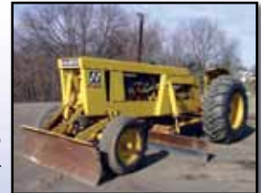
(1) OF (3) HUBER MAINTAINERS

HUBER Road Maintainer , s/n CM3597, Ford gas and Fuller 5 speed trans, 9' all hydraulic moldboard, 6' front knockdown blade, 7.50-16 front and 13.6x38 rear tires. In fair condition with fair tires.