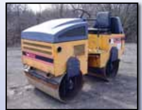
97 STONE WOLF PAC 3100