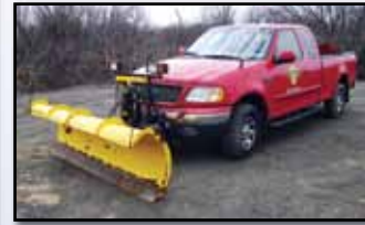
'01 FORD F-150 XLT 4X4

1986 FORD Model F-350 Flatbed Truck , 5.8L, V-8 gas and 4 speed trans, 9' flatbed with wooden stake sides, dual rear wheels, tow package with electric, and 235/85R16 tires.