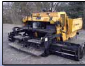
03 IR PF875L

2003 INGERSOLL-RAND/BLAW-KNOX Model PF875L Crawler Paver , s/n 120241-CFN, Kubota 3.3L diesel and hydrostatic trans, Liberty 8'-15' vibratory, heated, full matt screed, wash down system and hose, and 12" steel pads. In good condition with good undercarriage.