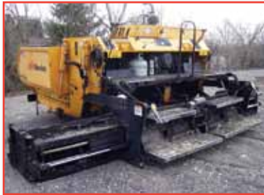
'03 IR PF875L