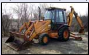
94 CASE 580SK 4X4 EXTEND-A-HOE

1997 CASE Model 580 Super L, 4x4 Tractor Loader Extend-A-Hoe , s/n JGG0202344, Case diesel and shuttle trans, GP bucket, 24" digging bucket, EROPS, 12-16.5 front and 19.5L24 rear tires. In good condition with good to very good tires.