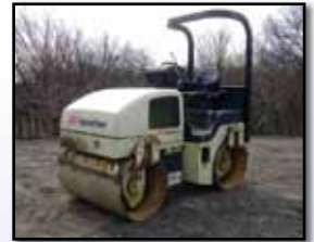
01 IR DD24

2001 MARATHON Model KEB170 Single Axle Tack Trailer , 170 gallon capacity, propane heat, 3,500GVWR, and 225/75R15 tires. In good condition with very good tires.