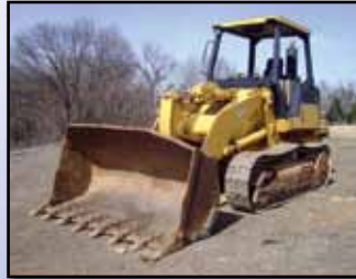
98 CAT 953C

1991 CASE Model 1155E Crawler Loader , s/n JAK0009852, Case diesel and powershift trans, general purpose loader bucket with teeth, enclosed ROPS cab with heat, and 16" DBG pads. In fair to good condition with fair undercarriage.