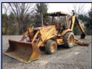
92 CASE 590 4X4 EXTEND-A-HOE