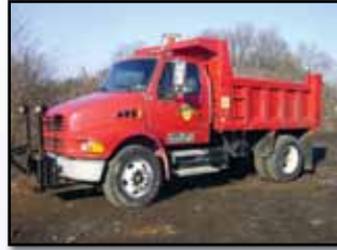
'03 STERLING M7500 W/PLOW

2003 STERLING Model M7500 Acterra Single Axle Dump Truck , Cat 3126, 275HP diesel and Eaton Fuller Roadranger 9 speed trans, Thiele 10'6" steel dump body with 3 chutes, 21,000# rear axle and 12,000# front axle, central hydraulic system, tow package with air, spring suspension, air brakes, cruise control, air conditioning, and 11R22.5 tires. In good condition with good tires.