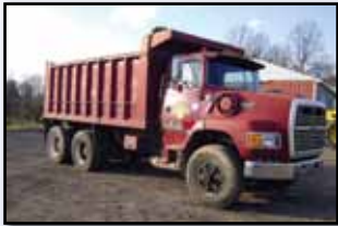
'91 FORD L8000

1991 FORD Model L8000 Tandem Axle Dump Truck , Ford 7.8L, 270HP (reman) diesel and Roadranger RT-760 8LL 10 speed trans, J&J 15' steel dump body with single chute, spring and beam suspension, exhaust brake, and 11R22.5 tires. In good condition with fair to good tires.