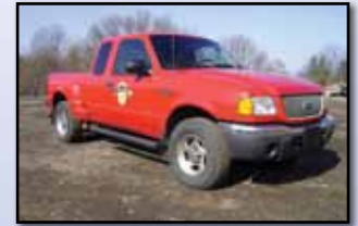
'01 FORD RANGER XLT 4X4

2001 FORD Model Ranger XLT, 4x4 Quad Cab Pickup Truck , 4.0L, 6 cylinder gas and automatic trans, 6' bed, sliding rear window, power windows, locks, and mirrors, running boards, cruise control, air conditioning, and 245/70R16 tires. In good condition with good tires.