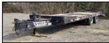
'01 CUSTOM 15 TON

2001 CUSTOM Model 15T262ADLP, 15 Ton Tandem Axle Tag-A-Long Trailer , 20'x8' load deck with 6' beavertail and ramps, anti-lock brake system, air brakes, max load 22,500#, 31,200# GVWR, and 215/75R17.5 tires. In good condition with good tires.