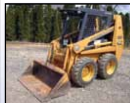
98 CASE 1840

FORD Model 2000 Utility/Broom Tractor , s/n Unknown, 4 cylinder gas and direct drive trans, Sweepster 6' rear broom, 3-point hitch, PTO, 6.50x16 front and 12.4-28 rear tires. In fair to good condition with good tires.