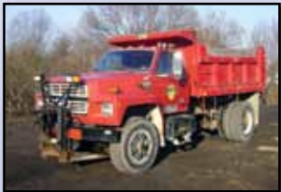
'93 FORD F-800

1993 FORD Model F-800 Single Axle Dump Truck , Cummins/Ford 8.3L diesel and 5 speed trans with 2 speed rear, 10' steel dump body with single chute and asphalt apron, Good Roads 10' hydraulic angle snow plow, spring suspension, and 11R22.5 tires. In good condition with good tires.