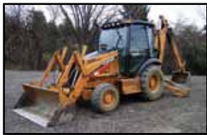
02 CASE 580M 4X4 EXTEND-A-HOE

Attachments: (2) 12" and 36" digging; 12" thumb; 42" bolt-on forks STANLEY MB-5 Hydraulic Demo Hammer