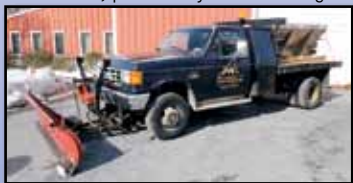
'90 FORD F-350 4X4

1990 FORD Model F-350, 4x4 Flatbed Truck , powered by 7.5 liter V-8 gas engine and 5 speed transmission, equipped with 9' flatbed body with stake pockets, Western 9' snowplow package, behind cab thru-tool boxes, dual rear wheels, air conditioning, and LT235/85R16 tires. In fair to good condition with fair to good tires. (Unit #805)