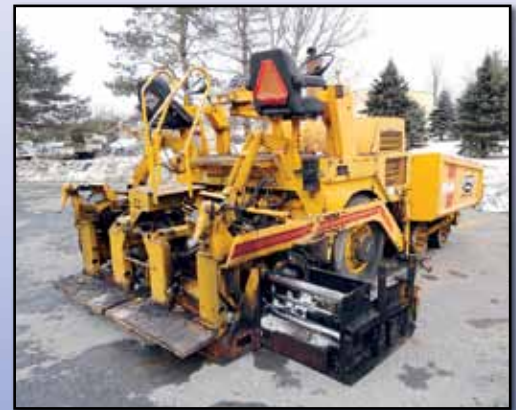
'94 BLAW KNOX PF-161

2005 INGERSOLL RAND/BLAW-KNOX Model PF2181 Rubber Tired Paver , s/n 181318, powered by Cummins 5.9 liter diesel engine and hydrostatic transmission, equipped with Ultimat 8'-16' heated vibratory screed with (2) 12" bolt-on extensions to 18' paving width, hydraulic strike-off tunnels, bogie drive assist, Blaw-Kontrol II model AGS7.5 electronic slope and grade controls (un-used),