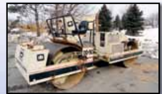
'96 IR DD-90

1996 INGERSOLL RAND Model DD-90 Tandem Vibratory Roller , s/n 145504, powered by Cummins 3.9 liter turbo diesel engine and hydrostatic transmission, equipped with 66" smooth drums, spray system with front and rear spray, 2-frequency vibration, and ROPS post roll-bar. In good condition. (Rental Purchase) BOMAG Model BW100AD Tandem Vibratory Roller , s/n 150124433, powered by Deutz diesel engine and hydrostatic transmission, equipped with 38.5" smooth drums and water system with front and rear spray. In good condition. (Cosmetically Fair)