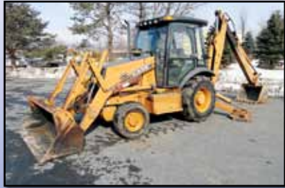
'01 CASE 580 SUPER M 4X4

2001 CASE Model 580 Super M 4x4 Tractor Loader Extend-A-Hoe , s/n JYG0279198, powered by Case diesel engine and shuttle transmission, equipped with general purpose loader bucket, 24" digging bucket, ride control, 4-lever backhoe controls, enclosed ROPS cab with air conditioning, 12x16.5NHS foam filled front and 19.5Lx24 rear tires. In good condition with poor front and good rear tires. (Meter Reads 06,527 Hours) (Purchased New)