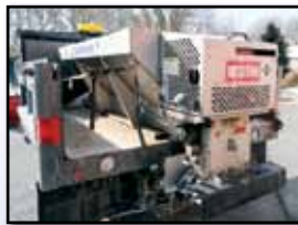
(1) OF (3) ALUMINUM SPREADERS

Snow Maintenance Equipment: WESTERN 8' Poly Plow with Ultra-Mount frame, lights, and controls • (1) BUYERS Stainless Steel Salt Spreader with gas engine and cab controls • (2) WESTERN Stainless Steel Salt Spreaders with gas engines and cab controls