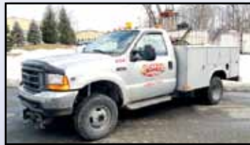
99 FORD F-350 XL 4X4

1999 FORD Model F-350 XL Super Duty 4x4 Utility Truck , powered by Triton V-10 gas engine and automatic transmission, equipped with Reading 9' open utility body, Western 9' Pro snowplow package, 100 gallon fuel tank with 12 volt pump, tow package with electric, dual rear wheels, air conditioning, and 235/85R16 tires. In good condition with good to very good tires. (Unit #824)