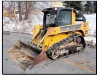
'07 JOHN DEERE CT322

2003 JOHN DEERE Model 270 Series II Skid Steer Loader , s/n 919678, powered by John Deere Powertech 4.5 liter diesel engine and hydrostatic transmission, equipped with 76" general purpose loader bucket, Hi-Flow auxiliary hydraulics, standard auxiliary hydraulics, foot controls, side counterweights, ROPS canopy, and 14/17.5 tires. In good condition with fair to good tires. (Meter Reads 3,421 Hours) (Rental Purchase)