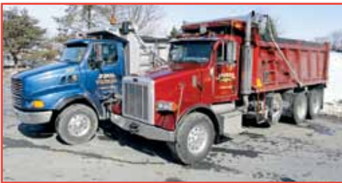
(2) OF (4) TRI-AXLE DUMPS