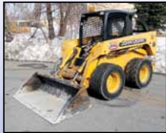
'03 JOHN DEERE 270 SERIES II

Skid Steer Attachments To Include: JOHN DEERE Model CP24 Worksite Pro 24" Hydraulic Cold Planer, with side shift control • CONEQTEC/UNIVERSAL Model AP300, 12" Cold Planer • SWEEPSTER Model ZBDC62M, 62" Hydraulic Sweeper, with dump hopper