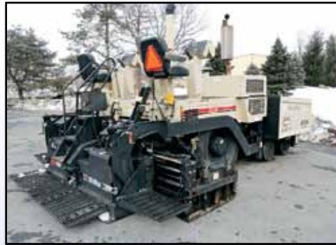
'05 IR-BLAW KNOX PF2181

power crown control, joint matching ski, and 16.00x24TG tires. In good to very good condition with good tires. (Meter Reads 2,138 Hours) (Purchased New)