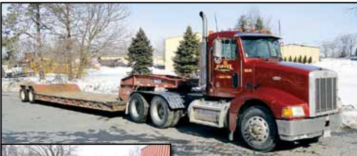
'97 PETERBILT 385 WITH '99 ROGERS 35 TON

1997 PETERBILT Model 385 Tandem Axle Truck Tractor , powered by Cat C-12, 395HP diesel engine and Eaton Fuller 10 speed transmission, equipped with 38,000# rears, 12,000# front axle, wetline system, 3-stage Jake brake, air slide 5th wheel, single frame, air ride suspension, air rid cab, aluminum Budd wheels, 120 gallon aluminum fuel tank, aluminum fenders, cruise control, air conditioning, heated mirrors, and 11R22.5 tires. In good condition with good tires. (Unit #804)