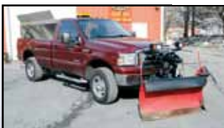
'05 FORD F-350 XLT 4X4 (SPREADER SOLD SEPARATELY)

2005 FORD Model F-350 XLT Super Duty, 4x4 Pickup Truck , powered by Powerstroke 6.0L diesel engine and automatic transmission, equipped with Western 8'6" MVP V-plow package, 8' bed, tow package with electric, power windows and locks, cruise control, air conditioning, AM/FM CD, and LT275/70R18 tires. In good condition with good tires. (46,174 Original Miles)