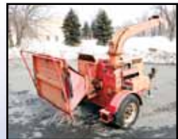
'93 GRAVELLY PRO-CHIP

good condition with good tires. (Meter Reads 707 Hours) (Purchased New) 1993 INGERSOLL RAND Model DX70 Walk Behind Vibratory Roller , s/n AD7136, powered by Kubota diesel engine and hydrostatic transmission. In good condition.