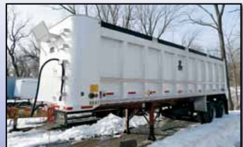
'86 COBRA 30' ALUMINUM

1986 COBRA 30' Tandem Axle Aluminum Dump Trailer , equipped with air tailgate and single chute, spring suspension, 18,000# GAWR, 73,280# GVWR, and 11R24.5 tires. In good condition with good tires. (Unit #804T)