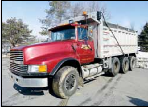
'94 FORD LTL9000 (UNIT #806)

1997 FORD Model Louisville 9500 Tri-Axle Dump Truck , powered by Cat 3406, 450HP diesel engine and Roadranger RTO 8LL, 10 speed transmission, equipped with Hwey model SD-176, 17'6" heated aluminum dump body with Aero power tarp, air gate, 46,000# rears, 18,000# front axle, spring/beam suspension, aluminum Budd wheels, 2-stage engine brake, air conditioning, cruise control, heated mirrors, 208" wheelbase, 64,000# GVWR, 315/80R22.5 front and lift, and 11R24.5 rear tires. In good condition with good tires. (Unit #817) (Purchased New)