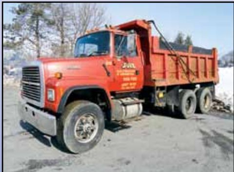
'95 FORD LT9000 (UNIT #815)

1988 FORD Model LTL9000 Tri-Axle Dump Truck , powered by Cat 3406B diesel engine and Roadranger RTO1170-8LL, 10 speed transmission, equipped with 16' steel dump body with electric tarp, single chute, 44,000# rears, 16,000# front axle, 2-stage engine brake, tow package with air and electric, air conditioning, heated mirrors, 315/80R22.5 front and 11R22.5 rear and lift tires. In good condition with good tires. (Unit #801) (Purchased New)