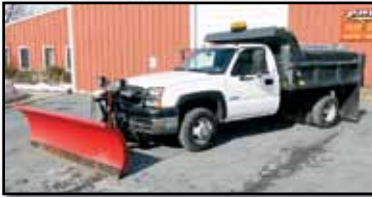
'03 CHEVY 3500 4X4

2003 CHEVROLET Model Silverado 3500, 4x4 Mason Dump Truck , powered by Vortec 6.0L gas engine and automatic transmission, equipped with 8'6" mason dump body with manual tarp, dual rear wheels, Western 9' Pro plow package, tow package, and LT215/85R16 tires. In good to very good condition with good tires. (17,635 Original Miles)