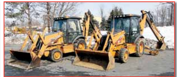
'05 AND '01 CASE 4X4 EXTEND-A-HOES