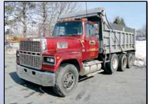
'88 FORD LTL9000 (UNIT #801)

1994 FORD Model LTL9000 Tri-Axle Dump Truck , powered by Cat 3406B, 14.6L diesel engine and Eaton Fuller RT1170-8LL, 10 speed transmission, equipped with J&J 17'6" heated aluminum dump body (heat not plumbed) with Aero power tarp, air gate, single chute, 46,000# rears, 18,000# front axle, airlift 3rd axle with dual wheels, spring suspension, engine brake, 73,280# GVWR, 385/65R22.5 front and 11R24.5 rear and lift tires. In good condition with good tires. (Less Than 100,000 Miles on Rebuilt Transmission) (Unit #806) (Purchased New)