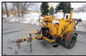
'95 LEEBOY L250

propane heat, and ST205/75R15 tires. In good condition. (Purchased New)