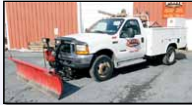
'00 FORD F-450XL 4X4

2000 FORD Model F-450 XL Super Duty 4x4 Utility Truck , powered by Powerstroke 7.3 liter diesel engine and 6 speed transmission, equipped with Reading 9' open utility body, Western 9' Pro snowplow package, 100 gallon fuel tank with 12 volt pump, dual rear wheels, tow package with electric, air conditioning, and 225/70R19.5 tires. In good condition with good tires. (Unit #819) (Purchased New)