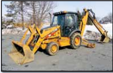
'05 CASE 580 SUPER M SERIES II, 4X4

2001 CASE Model 580 Super M 4x4 Tractor Loader Extend-A-Hoe , s/n JYG0279198, powered by Case diesel engine and shuttle transmission, equipped with general purpose loader bucket, 24" digging bucket, ride control, 4-lever backhoe controls, enclosed ROPS cab with air conditioning, 12x16.5NHS foam filled front and 19.5Lx24 rear tires. In good condition with poor front and good rear tires. (Meter Reads 06,527 Hours) (Purchased New)