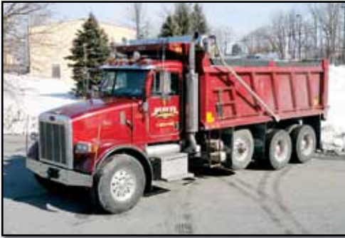
'06 PETERBILT 357 (UNIT #827)

2006 PETERBILT Model 357 Tri-Axle Dump Truck , powered by Cat C-13 Acert 430HP diesel engine and Eaton Fuller 8LL, 10 speed transmission, equipped with Heil 18' steel dump body with bed vibrator, 2-way air gate, single chute, Aero power tarp, 46,000# rears, 20,000# front axle, 22,000# lift axle, air ride suspension, aluminum Budd wheels, 2-stage engine brake, cruise control, power windows and locks, heated power mirrors, tow package with air, 425/65R22.5 front and lift, and 11R24.5 rear tires. In good to very good condition with good tires. (Odometer Reads 90,170 Miles) (Unit #827) (Purchased New)