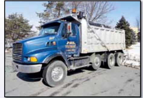
'97 FORD LOUISVILLE 9500 (UNIT #817)

2006 PETERBILT Model 357 Tri-Axle Dump Truck , powered by Cat C-13 Acert 430HP diesel engine and Eaton Fuller 8LL, 10 speed transmission, equipped with Heil 18' steel dump body with bed vibrator, 2-way air gate, single chute, Aero power tarp, 46,000# rears, 20,000# front axle, 22,000# lift axle, air ride suspension, aluminum Budd wheels, 2-stage engine brake, cruise control, power windows and locks, heated power mirrors, tow package with air, 425/65R22.5 front and lift, and 11R24.5 rear tires. In good to very good condition with good tires. (Odometer Reads 90,170 Miles) (Unit #827) (Purchased New)