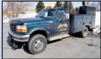
'97 FORD F-350 XL 4X4

1997 FORD Model F-350 XL, 4x4 Utility Truck , powered by Powerstroke 7.3 liter diesel engine and automatic transmission, equipped with Reading 9' open utility body, Western 9' snowplow package, 100 gallon fuel tank with 12 volt pump, air conditioning, and 235/85R16 tires. In good condition with good tires. (Unit #818) (Purchased New)