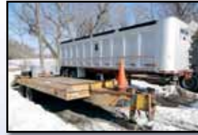
GENERAL 15 TON

1978 GENERAL 15 Ton Tandem Axle Tag-A-Long Trailer , equipped with 17'x8' load deck, 5' beavertail with ramps, air brakes, chain dogs, and 8.25R15TR tires. In good condition with good tires.