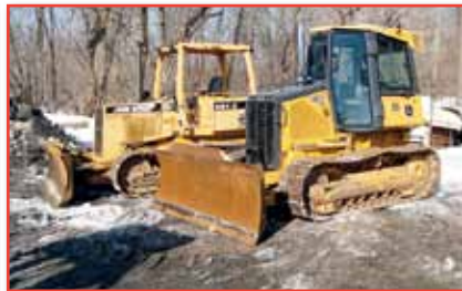
'05 JD 650J XLT AND '96 JD 450G LT