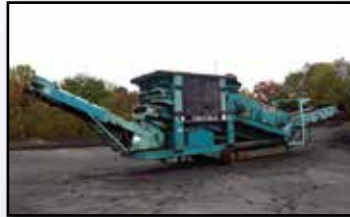
'05 POWERSCREEN TITAN 1800

2005 POWERSCREEN Model Titan 1800 Crawler Screening Plant , s/n 12101423, powered by Deutz 4 cylinder, liquid cooled diesel engine and hydrostatic drive, equipped with 8'x16' dump hopper with 60" belt feeder, 5'x16' double deck vibrating screen, (2) 36" side discharge conveyors, 56" front discharge conveyor, 48" rear transfer conveyor, 36" swiveling rear discharge conveyor, and 20" TBG pads. In good condition with good undercarriage.