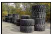
NEW AND USED ON-OFF ROAD TIRES