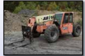
'02 JLG/GRADALL G6-42A