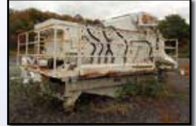
'80 DEISTER 5'X6' WET