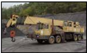
'74 GROVE TMS475LP

In fair to good condition with fair to good tires. (TUSCARORA)