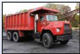
'92 MACK DM690S

1992 MACK Model DM690S Tandem Axle Dump Truck , powered by Mack EM7-275 diesel engine and Maxitorque T2070 7 speed transmission, equipped with beam suspension, 44,000# rears, Summit 16' steel dump body, and 12R24.5 tires. In good condition with good tires.