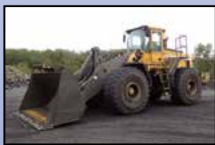
'99 VOLVO L220D

1999 VOLVO Model L220D Rubber Tired Loader , s/n L220DV1220, powered by Volvo 6 cylinder diesel engine and powershift transmission, equipped with general purpose loader bucket with bolt-on cutting edge, EROPS with heat and air conditioning, high lift configuration, Load Rite LR925 bucket scale, and 29.5R25 tires. In good condition with good tires. (TUSCARORA)