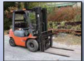
'99 TOYOTA 7FGU20