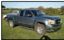
'08 GMC 1500 4X4

2008 GMC Model 1500 Sierra, 4x4 Quad Cab Pickup Truck , powered by Vortec 5.3 liter diesel engine and automatic transmission, equipped with 7' bed, side boxes, tow package, running boards, power windows, locks, mirrors, and seats, cruise control, air conditioning, and 265/70R17 tires. In good condition with good tires.