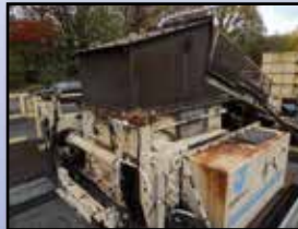
'89 GUNDLACH 2028

1989 GUNDLACH Model 2028 Roll Crusher , s/n 4024SSHD2028R, powered by 60HP electric motor, with hydraulic adjustment. In good condition. (Mounted on Steel Supports with 30"x35" Channel Conveyor with 10HP motor – Buyer Must Load)