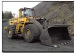
'00 VOLVO L330D