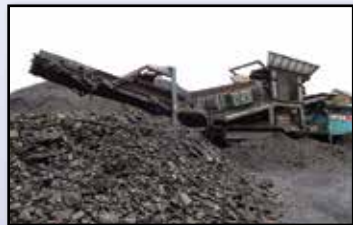
'03 POWERSCREEN TITAN 1800

2002 POWERSCREEN Model Titan 1800 Crawler Screening Plant , s/n 12100073, powered by Deutz 4 cylinder, liquid cooled diesel engine and hydrostatic drive, equipped with approximately 8'x15' dump hopper with belt feeder, 5'x16' double deck vibrating screen, remote, and 52" front and rear discharge conveyors. In good condition with good undercarriage. (KASKA)