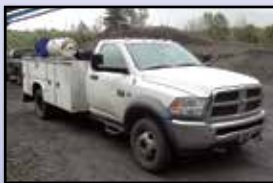
'12 RAM 4500 HD

2012 RAM Model 4500 HD Utility Truck , powered by Cummins 6.7 liter diesel engine and automatic transmission, equipped with 11' open service body, IR 2 stage gas powered air compressor, 100 gallon fuel tank with electric pump, self-winding air hose reel, running boards, tow package, power windows, locks, mirrors and seats, cruise control, air conditioning, and 225/70R19.5 tires. In good condition with good tires.