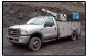
'05 FORD F-550

2005 STERLING Single Axle Service Truck , powered by Mercedes 6 cylinder diesel engine and automatic transmission, equipped with 11' open service body, 22" work bumper with vise, Stellar SHD60 hydraulic air compressor, Miller Bobcat 225 welder generator, powered by Kohler 2 cylinder gas engine, Stellar 10620 hydraulic service boom, 10,000# capacity, 200 gallon 2 compartment product tank with pneumatic pumps and self-winding hose reels. (2) hydraulic extending outriggers, aluminum wheels, heated mirrors, cruise control, air conditioning, and 295/75R22.5 tires. In good condition with good tires.