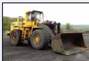
'98 VOLVO L330C

1974 CATERPILLAR Model 920 Rubber Tired Loader , s/n 62K6280, powered by Cat 3304 diesel engine, equipped with enclosed ROPS cab, general purpose loader bucket, and 15.5x25 tires. In fair to good condition with 3 good and 1 fair to poor tires.