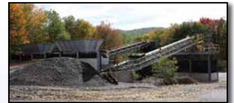
CRUSHING AND SIZING PLANTS

NOTE: The components will be offered individually, then the aggregate high bids will be increased by 10% and offered in an entire line. The items will sell to the highest bids, either totaled piecemeal or entirety. (Each Component With Individual Starters/Controllers)