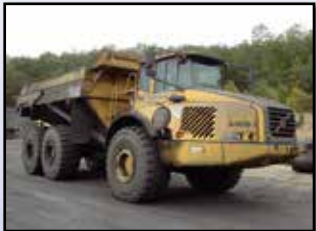
'03 VOLVO A40D

1997 VOLVO Model A40 Articulated End Dump , s/n A40V60172, powered by Volvo 6 cylinder diesel engine and 4 speed automatic transmission, equipped with retarder, EROPS with heat, lined and heated bed with tailgate, and 29.5R25 tires. In good condition with fair to good tires. (Needs Drop Box Rebuilt) (TUSCARORA)