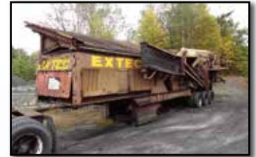
'02 EXTEC 5000 TURBO

2002 EXTEC Model 5000 Turbo Portable Screening Plant , s/n 6771, powered by 6 cylinder diesel engine, equipped with 6'x12' feed hopper with hydraulic grizzly and belt feeder, 36"x40' screen feed conveyor, 4'x12' double deck vibrating screen, (2) 28" side discharge conveyors, 46" rear discharge conveyor, mounted on tri axle carrier, and 275/70R225 tires. In fair to good condition with good tires. (TUSCARORA)