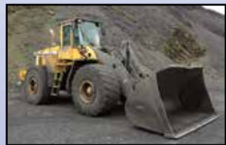
'99 VOLVO L220D

1999 VOLVO Model L220D Rubber Tired Loader , s/n L220DV1270, powered by Volvo TD122KLE diesel engine and powershift transmission, equipped with JCB 8 yard general purpose loader bucket, EROPS with heat and air conditioning, and 29.5R25 tires. In good condition with fair to poor tires. (TUSCARORA)