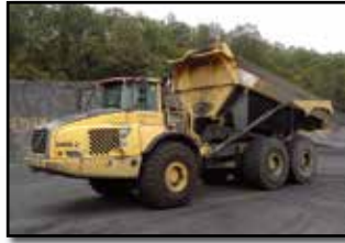
'06 VOLVO A40D

2006 VOLVO Model A40D Articulated End Dump , s/n A40DV12864, powered by D12DA6E3 diesel engine and 4 speed automatic transmission, equipped with retarder, EROPS with heat and air conditioning, lined and heated bed with tailgate, companion seat, and 29.5R35 tires. In good condition with good tires. (Runs Well and Moves; Transmission Issues) (TUSCARORA)