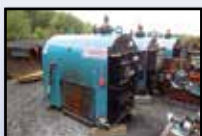
COAL FIRED BOILERS

MILLER Trailblazer 302 Welder/Generator, s/n LJ080044Q, 3 cylinder diesel engine • MILLER 300 Amp Electric Welder, with wire feed • SNAP-ON Welder • THERMAL DYNAMICS Plasma Cutter • Shop Welders • INGERSOLL-RAND T30 Vertical Shop Air Compressor • Horizontal Shop Air Compressor • KENOWA 8,000 Watt Gas Powered Generator • WALKER TURNER (4) Spindle Drill Press • Drill Presses • MK Wet Saw • PORTO MAG Magnetic Drill Press • HYD MECH S20 Horizontal Metal Cutting Band Saw, with control station • CAROLINA Band Saw • GILSON TM36 Test Shaker, s/n T1523 • GILSON Test Screens • FAIRBANKS Platform Scale • Model M2000 Pressure Washer, skid mounted with water tank. In poor condition. • Bolt Bins • Pallet Racking • Pumps • Banding Tools • Ice Melt