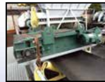
36"X60" BELT MAGNET

(4) DINGS 36"x96" Magnetic Separators , powered by 3HP