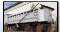
'81 COBRA 34'

1981 COBRA 34' Tandem Axle Aluminum Dump Trailer , equipped with spring suspension, chute, electric tarp, and 11R24.5 tires. In good condition with good tires.