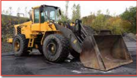
'06 VOLVO L180E-2