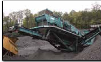
'08 POWERSCREEN CHIEFTAIN 2100X WITH bivi-TEC

2008 POWERSCREEN Model Chieftain 2100X Crawler Screening Plant , s/n PID00124T89D10194, powered by Cat 4 cylinder diesel engine and hydrostatic drive, equipped with 6'x13' double deck hopper with hydraulic grizzly and belt feeder, 42" screen feed conveyor, 2008 bivi-TEC Model KRL/DD1600X6, 56"x20' 2-deck vibrating screen, s/n SBT1049, (2) 32" side discharge conveyors, 48" under screen discharge conveyor, and 20" TBG pads. In good condition with good undercarriage. (KASKA)