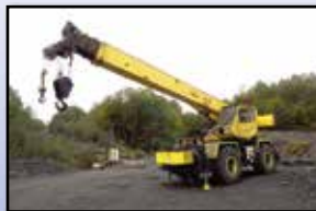
'89 P&H CN128

1989 P&H Model Omega CN128, 28 Ton Rough Terrain Crane , s/n 55454, powered by Cummins 6 cylinder diesel engine and powershift transmission, equipped with 21' to 91' 4-section hydraulic boom, Liftek anti-2 block alarm, auxiliary hoist, 4-sheave hook block, ball hook, (4) hydraulic extending outriggers, enclosed cab with heat, and 20.5x25 tires. In good condition with good tires. (Reserved For Use During Loadout Until 11/19/15 @ Noon)