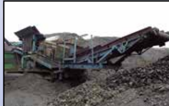
'02 POWERSCREEN TITAN 1800

2002 POWERSCREEN Model Titan 1800 Crawler Screening Plant , s/n 12100073, powered by Deutz 4 cylinder, liquid cooled diesel engine and hydrostatic drive, equipped with approximately 8'x15' dump hopper with belt feeder, 5'x16' double deck vibrating screen, remote, and 52" front and rear discharge conveyors. In good condition with good undercarriage. (KASKA)