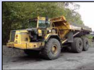
'97 VOLVO A40

1997 VOLVO Model A40 Articulated End Dump , s/n A40V60172, powered by Volvo 6 cylinder diesel engine and 4 speed automatic transmission, equipped with retarder, EROPS with heat, lined and heated bed with tailgate, and 29.5R25 tires. In good condition with fair to good tires. (Needs Drop Box Rebuilt) (TUSCARORA)