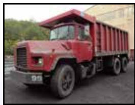
'00 MACK DM690S

2000 MACK Model DM690S Tandem Axle Dump Truck , powered by Mack EM7-300 diesel engine and Maxitorque T2080 8 speed transmission, equipped with camel back suspension, 44,000# rears, Summit 17' steel dump body, Jacobs 2 stage engine brake, cruise control, and 11R24.5 tires. In good condition with good tires.