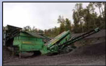
'08 MCCLOSKEY S190

2008 McCLOSKEY Model S190 Portable Hydraulic Screening Plant , s/n SA9000S1908M066243, powered by Cat 4 cylinder diesel engine, equipped with 6'x14' dump hopper with hydraulic grizzly and belt feeder, 48" screen feed conveyor, 5'x20' double deck vibrating incline screen, front discharge conveyor, (2) 30" hydraulic wing conveyors, mounted on tri axle carrier, and 235/75R17.5 tires. In good condition with good tires. (KASKA)