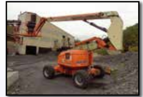
'05 JLG 600AJ

1989 HYSTER Model H60XL, 6000# Capacity Solid Tired Forklift , s/n A177B34826K, powered by 4 cylinder propane gas engine and hydrostatic transmission, equipped with 189" 3 stage mast, mast tilt, side shift, 60" forks, ROPS canopy, 7.00x15 front and 6.00x9 rear tires. In good condition with good tires.