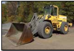
'00 VOLVO L120C

2000 VOLVO Model L120C Rubber Tired Loader , s/n L120CV62616, powered by Volvo TD73KDE diesel engine and powershift transmission, equipped with Volvo hydraulic coupler, auxiliary hydraulics, EROPS with heat and air conditioning, quick disconnect general purpose loader bucket, s/n 03-05-05, and 33.5R25 tires. (Reserved For Use During Loadout Until 11/19/15 @ Noon)