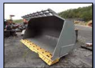
VOLVO 9 CUBIC YARD (L330)

BALDERSON 34039 Fork Attachment (Cat 920) • Detachable Loader Bucket (Volvo L180E/L150E) • 6 Yard Bucket (Volvo L180E/L50E) • 9 Yard Bucket (Volvo EMQ10) • JRB WA500-3, 8yd3 General Purpose Bucket , s/n AKR2160, 11' wide. In good to very good condition. (Komatsu WA500) • VOLVO 93495, 9 yd3 General Purpose Loader Bucket , s/n 01-01-04C, with bolt-on cutting edge, 13' wide. In good to very good condition. (Volvo L330) • Volvo L150 Loader Boom