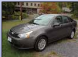
'10 FORD FOCUS

2010 FORD Model Focus SE, 4 Door Sedan , powered by 4 cylinder gas engine and automatic transmission, equipped with power locks and mirrors, cruise control, air conditioning, and 195/60R15 tires. In good condition with good tires.