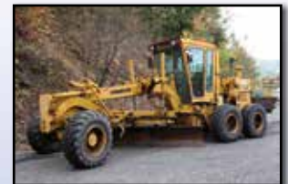
'83 CHAMPION 720A

1983 CHAMPION Model 720A Articulated Motor Grader , s/n 720A-13-12-15824, powered by Detroit 6 cylinder diesel engine and powershift transmission, equipped with 14' fully hydraulic moldboard, EROPS with heat, front scarifier, and 17.5x25 tires. In good condition with fair tires.