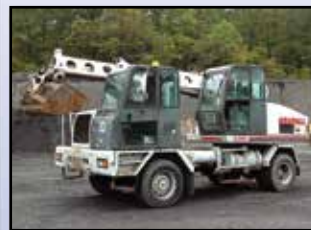
'01 GRADALL XL3100

CP 36" Digging Bucket , s/n 39C40036. In good condition. (Komatsu PC400) • HENDRIX 2yd3 Digging Bucket , s/n 3037320-1. In good condition. (Komatsu PC400)