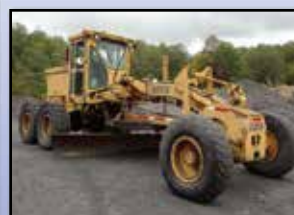
'78 CLARK S501

1978 CLARK Model S501 All Wheel Drive Motor Grader , s/n 622A088, powered by Detroit 6-71 diesel engine and powershift transmission, equipped with EROPS with heat, 12' fully hydraulic board, front scarifier, rear wheel steer, and 14.00R24 tires. In good condition with fair to good tires. (TUSCARORA)