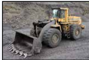
'99 VOLVO L330C