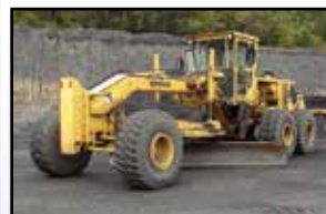
'77 CAT 16G

1977 CATERPILLAR Model 16G Articulated Motor Grader , s/n 93U1072, powered by Cat 3406 diesel engine and powershift transmission, equipped with EROPS with heat, 16' fully hydraulic mold board, front push plate, rear mounted ripper with 3 shanks, and 23.5R25 tires. In good condition with fair tires. (TUSCARORA)