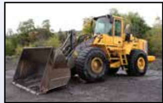
'05 VOLVO L180E

2005 VOLVO Model L180E Rubber Tired Loader , s/n L180EV6724, powered by Volvo D12CLCE2 diesel engine and powershift transmission, equipped with general purpose loader bucket with bolt-on cutting edge, EROPS with heat and air conditioning, Load Rite Pro bucket scale, and 26.5R25 tires. In good condition with good tires.