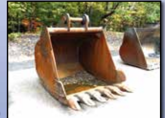
HENDRIX 2 CUBIC YARD (PC400)

CP 36" Digging Bucket , s/n 39C40036. In good condition. (Komatsu PC400) • HENDRIX 2yd3 Digging Bucket , s/n 3037320-1. In good condition. (Komatsu PC400)