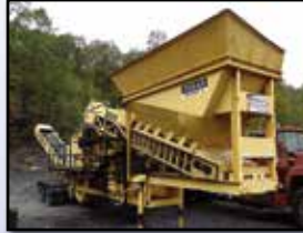
'96 TESAB RK623

1996 TESAB Model RK623 Portable Impact Crusher , s/n 04231099, powered by Cat 3306 diesel engine with Twin Disc torque converter, equipped with 1996 model RK623 rotary crusher, s/n 231, 12'x6' dump hopper, 30"x25" crusher feed conveyor, 24"x30" discharge conveyor, mounted on tandem axle carrier, hydraulic opening shell, and 235/75R17.5 tires. In good condition with good tires. (TUSCARORA)