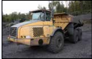
'04 VOLVO A40D