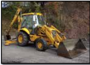
'95 JCB 214 II 4X4