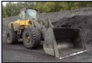
'06 VOLVO L220E

2006 VOLVO Model L220E Rubber Tired Loader , s/n L220EV4505, powered by Volvo 6 cylinder diesel engine and powershift transmission, equipped with coal bucket with Black Hawk cutting edge segments, EROPS with air conditioning, Loadrite L series 2180 bucket scale, and 29.5R25 tires. In good condition with good tires. (TUSCARORA)