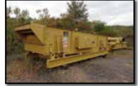
'12 TRIO SCREEN AND FEEDER

(2) INVICTA Screen Motions . In fair condition.