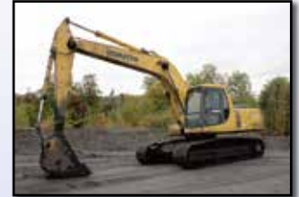
'94 KOMATSU PC200LC-6L

2007 KOMATSU Model PC400LC-7E0 Galeo Hydraulic Excavator , s/n A87460, powered by Komatsu EcoT3 6 cylinder diesel engine and hydraulic drive, equipped with 14'6" dipper stick, hydraulic plumbing, 56" Geith digging bucket, counterweight removal device, EROPS with heat and air conditioning, thumb attachment, and 31.5" TBG pads. In good condition with good undercarriage. (TUSCARORA)