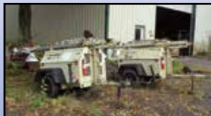
IR LIGHT PLANTS

2003 INGERSOLL-RAND Light Source Portable Light Plant , s/n 332616UIM789, powered by Kubota 3 cylinder diesel engine, equipped with manual raise, (1) light, and 175/80D13 tires. In fair condition. (Missing Lights)