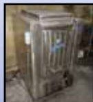
GILSON TEST SHAKER

TRAILMOBILE 40' Tandem Axle Storage Trailer and Other Storage Trailers • (4) 8'x20' Containers • (3) BURNHAM Model 4NW-345A Coal Fired Boilers, s/n's 29236, 29233, and 29232, 42.2 BHP gross output, with Fire Jet FJP burner/blowers, augers and stacks. In good condition • Large Quantity of On and Off Road Tires (New and Used) (24.5's etc.)