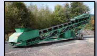
'10 MCCLOSKEY 36"X80'

2008 McCLOSKEY Model S36X80/DKT, 36"x80' Portable Hydraulic Conveyor , s/n 13466, powered by Kubota 4 cylinder diesel engine, equipped with hydraulic raise and lower, and 255/70R22.5 tires. In good condition with good tires. (KASKA)