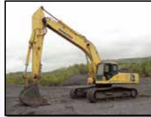
'07 KOMATSU PC400LC-7E0

1994 KOMATSU Model PC200LC-6L Hydraulic Excavator , s/n A080702, powered by Komatsu 6 cylinder diesel engine and hydraulic drive, equipped with Geith 36" digging bucket, 9'6" dipper stick, EROPS with heat, and 27.5" TBG pads. In good condition with good undercarriage.