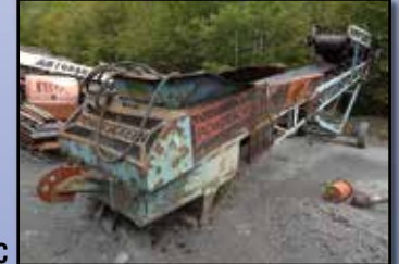
POWERSCREEN 30"X60' HYDRAULIC

GRASAN 36"x75' Hydraulic Radial Stacker , s/n 7536P2977, equipped with manual raise, manual angle wheels, and 8.00x20 tires. In good condition with very good to excellent tires. (TUSCARORA)