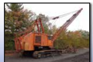
MANITOWOC 3900 VICON

1962 MANITOWOC Model 3900 Vicon Crawler Dragline , s/n 39506, powered by Cummins 855 diesel engine and twin torque converters, equipped with approximately 4 yard drag bucket, 90' of bolt together angle boom, fairlead, air controls, 19'x16" crawlers, 2-piece rear counterweight, and 38" smooth pads. In fair to good condition with fair undercarriage. Miscellaneous Dragline Buckets , with hardware