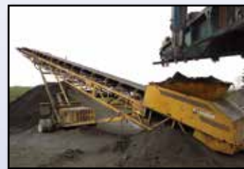
'08 MCCLOSKEY 36"X80'

2010 McCLOSKEY Model 36"x80' DKT, Hydraulic Portable Radial Stacker , s/n 70679, powered by Kubota 4 cylinder diesel engine, equipped with hydraulic raise, manual angle wheels, aluminum wheels, and 255/170R22.5 tires. In very good condition with excellent tires.