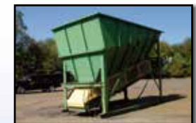
10 CUBIC YARD HOPPER

54"x200' Lattice Conveyor , equipped with catwalk and 48" rolled belt. In fair condition.