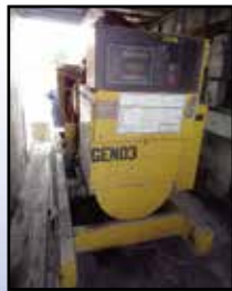
'95 CAT 225KW

CATERPILLAR Model 3304, 105KW Skid Mounted Generator , s/n 4B17548. In fair to good condition.