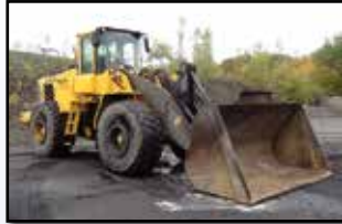
'06 VOLVO L180E-2

2006 VOLVO Model L180E-2 Rubber Tired Loader , s/n L180EV8321, powered by Volvo 6 cylinder diesel engine and powershift transmission, equipped with general purpose loader bucket with bolt-on cutting edge, EROPS with heat and air conditioning, high lift configuration, Load Rite L series 2180 bucket scale, and 26.5R25 tires. In good condition with good tires.