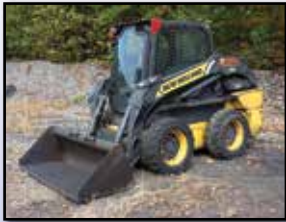
'11 NEW HOLLAND L218