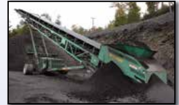
'09 MCCLOSKEY 36"X80'

2009 McCLOSKEY 36"x80' Portable Conveyor , s/n 70020, powered by Kubota 4 cylinder diesel engine, equipped with manual oscillating wheels, hydraulic raise and lower, and 255/70R22.5 tires. In good condition with good tires. (KASKA)