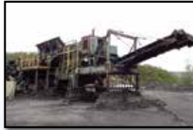
BROWN LENOX 42"x32"

BROWN LENOX Model 42"x32" Portable Jaw Crusher , s/n 120M4878, powered by Cat 3306 diesel engine with twin disc torque converter, equipped with 42"x16" vibrating plate feeder, 42"x32" jaw crusher, 40"x40" discharge conveyor, mounted on tri axle carrier, and 12R22.5 tires. In fair to good condition with good tires. (Missing (2) Tires and Rim) (TUSCARORA)