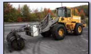
'05 HOLMS 10' BROOM (LOADER SEPARATE)

SWEEPSTER Model B626M8, 8' Dumping Broom , s/n 0431006. In good condition.