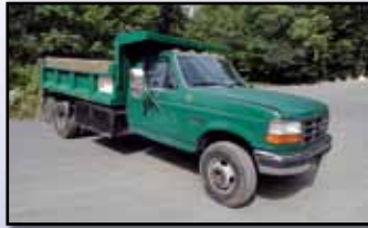
'97 FORD F450

2001 FORD Model F350XL Super Duty 4x4 Mason Dump , Triton 5.4L, V-8 gas and auto trans, Heil 8' mason dump body, underbody toolbox and ratchet straps, dual rear wheels, tow package, A/C, and 235/85R16 tires. In good condition with very good tires.