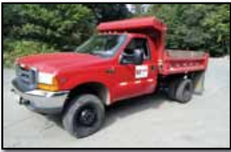
'01 FORD F350XL 4X4

1997 FORD Model F450 Super Duty Mason Dump , Powerstroke diesel and auto trans, Dejana 10' mason dump body, dual rear wheels, tow package, and 235/85R16 tires. In good condition with good tires.