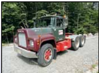
69 MACK R685ST

1989 MACK Model R688T Single Axle Dump Truck , 5 speed trans with 2 speed rear, 10' dump body with chute, air brakes, tow package with air, A/C, and 11R22.5 tires. In fair to good condition with good tires.