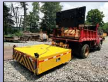
80 INT'L 1854 WITH RENCO ATTENUATOR

1980 INTERNATIONAL Model 1854 Single Axle Dump/Attenuator Truck , International diesel and auto trans, Renco RAM815 attenuator, s/n 1582CK with hydraulic lift, Amida diesel arrowboard, air brakes, 152" wheelbase, and 11.00R20 tires. In fair condition with good tires.