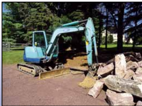
'05 IHI 45NX2

2005 IHI Model 45NX2 Mini Excavator , s/n WG002221, diesel, 5'4" stick, hydraulic beyond, swing boom, 18" digging bucket, 6'5" backfill blade, and 16" rubber tracks. In good condition with good undercarriage.