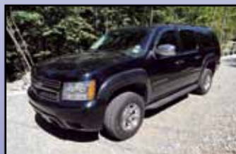
'07 CHEVY SUBURBAN LT 4X4

2007 LINCOLN Navigator 4x4 Sport Utility Vehicle , V-8 gas and auto trans, full power package, power moon roof, navigation system, rear DVD player, leather interior, heated seats, power folding 3rd row seats, and 275/55R20 tires. In good condition with good tires.