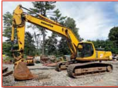
'00 KOMATSU PC400LC-6LK