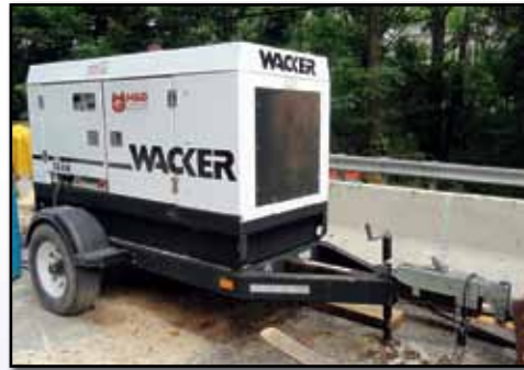
'05 WACKER G70

2006 INGERSOLL RAND Model P600WIR, 600 CFM Portable Air Compressor , s/n 367661UBQ278, JD diesel, 8.75-16.5 tires. In good to very good condition with good tires. (2,309 Hours) (Purchased New)