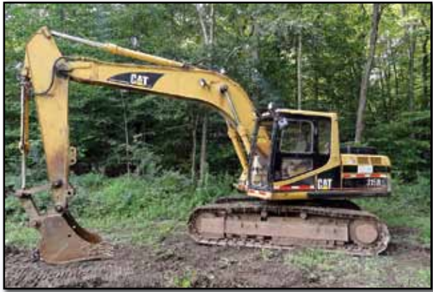
98 CAT 315BL

1984 KOMATSU Model PC400LC-3 Hydraulic Excavator , s/n 11114, Komatsu diesel, 11' dipper stick, 60" digging bucket, 36" TBG pads, and 17'9" crawlers. In fair to good condition with fair to good undercarriage.