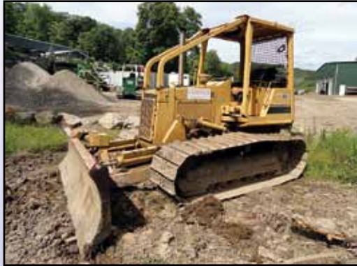
'89 CAT D3C LGP

1989 CATERPIL-LAR Model D3C LGP Crawler Tractor , s/n 1PJ00549, Cat 3204 diesel and powershift trans, 6-way hydraulic straight blade, ROPS canopy with sweeps, 25" SBG pads, and tow hitch. In good condition with fair to good undercarriage.