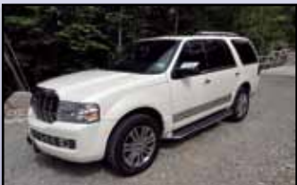
'07 LINCOLN NAVIGATOR 4X4

1999 FORD Model F450XL Super Duty 4x4 Cab & Chassis , Triton V-10 gas and auto trans, dual rear wheels, A/C, and 225/70R19.5 tires. In good condition with good to very good tires.