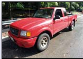
'03 FORD RANGER

2011 FORD Model F350XLT Super Duty Extended Cab Pickup Truck , Powerstroke 6.7 liter turbo diesel and auto trans, Western 8' Pro Plow with Ultra-Mount, 6.5' bed with cross box and spray liner, full power package, power folding and extending mirrors, heated seats, cloth interior, CD/MP3, Bluetooth, running boards, hide-away step tailgate, tow package, Pro Comp