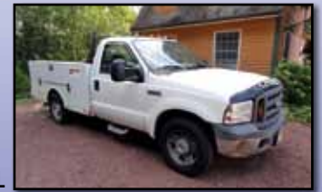
'05 FORD F350XL

2005 CHEVROLET Model 2500 HD Silverado Utility Truck , Vortec 6.0 liter V-8 gas and auto trans, Knapheide 8' open utility body with aluminum material rack, 50 gallon fuel cell with 12 volt pump, A/C, and 245/75R16 tires. In good condition with good tires.