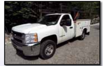
'08 CHEVY 2500 HD

2008 CHEVROLET Model 2500 HD Utility Truck , Vortec 6.0 liter V-8 gas and auto trans, Knapheide 8' open utility body with material rack, 50 gallon fuel cell with 12 volt pump, tow package, A/C, and 245/75R16 tires. In good condition with good tires.