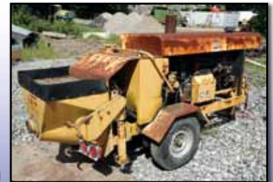
87 MORGAN MU-40

ALLAN Razorback 46' Concrete Screed, with work bridge • (2) GARBRO Round Concrete Buckets • (2) STONE 1285PM and 866PM Portable Mortar Mixers, Honda 8HP • (2) STONE 95CM and 65CM Portable Concrete Mixers, Honda 8HP • (3) IMER Portable Concrete Mixers, with poly tubs, Honda 3HP • IMER Readyman 120 Pan Mixer, electric • 1993 AEROIL Portable Tar Pot, s/n KEB230, propane saddles. In good condition.