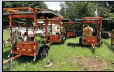
ARROWMASTER AND AMIDA ARROWBOARDS

(4) ARROWMASTER Solar Arrow Boards , s/n 03034017, 03031022, 03034015, 03034023. In good to very good condition. (Purchased New)