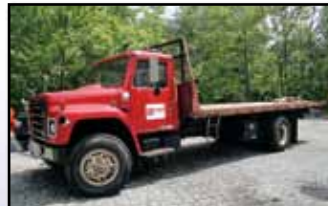
88 INT'L ROLLBACK

1983 INTERNATIONAL Model 1954 Single Axle Flatbed Truck , International diesel and auto trans, 17' flatbed, wooden deck, air brakes, and 11R22.5 tires.