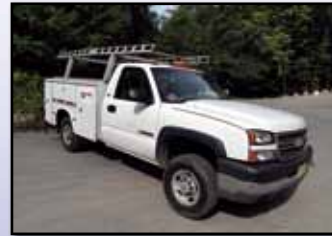
'05 CHEVY 2500 HD

2005 FORD Model F350XL Super Duty Utility Truck , Triton 5.4L gas and auto trans, Stahl 9' open utility body, tow package, A/C, and 275/65R18 tires.