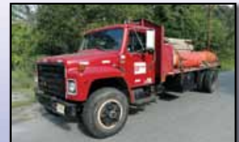
83 INT'L 1954

1988 INTERNATIONAL Model 1954 Single Axle Rollback Truck , International diesel and auto trans, 22' steel rollback body, Ramsey winch, ratchet straps, underbody toolbox, air brakes, and 11R22.5 tires.