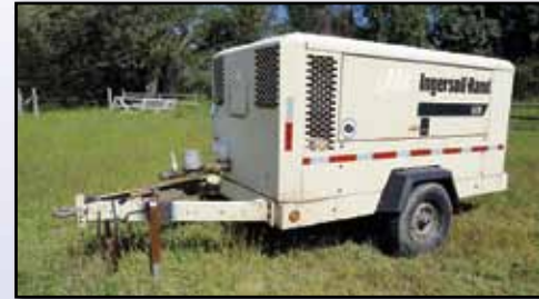
'06 IR P600WIR

INGERSOLL RAND 185 CFM Portable Air Compressor , s/n 207352U308, JD diesel. In fair condition.