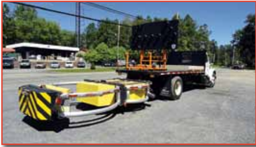
'01 INT'L WITH SCORPION ATTENUATOR