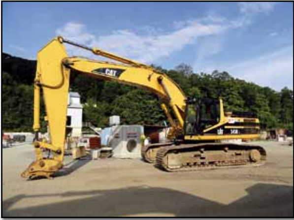
01 CAT 345BL SERIES II

2001 CATERPILLAR Model 345BL Series II Hydraulic Excavator , s/n AGS00786, Cat diesel, 13' stick, hydraulic quick coupler, 60" digging bucket, 35.5" TBG pads, 17'6" crawlers, and A/C. In good condition with good undercarriage. (5,021 Hours) (Purchased New)