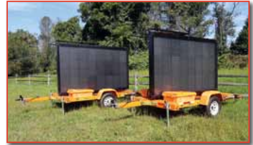
(2) '12 SOLARTECH SILENT MESSENGERS