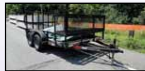
'04 PARKER PERFORMANCE

2000 TOW MASTER CONTRAIL Model C10, 5 Ton Tandem Axle Tag-A-Long Trailer , 16'x6'6" wooden deck with ramps, electric brakes, 12,600# GVWR, and 225/75R15 tires. In good condition with good tires.