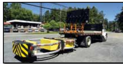
01 INT'L 470 WITH SCORPION ATTENUATOR

2001 INTERNATIONAL Model 4700 Single Axle Attenuator Truck , International T444E, 195HP diesel and Allison auto trans, Scorpion attenuator (TMU No. 03764), Wanco solar arrowboard, 17' flatbed, ratchet straps, and air brakes. In good condition with good tires.