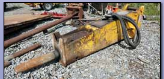
08 STANLEY MB-100EXS