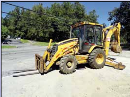
'97 CAT 426C 4X4

1997 CATERPILLAR Model 426C, 4x4 Tractor Loader Backhoe , s/n 6XN00810, Cat diesel and shuttle trans, Hewitt hydraulic side dump bucket, front quick coupler, front auxiliary hydraulics, rear plumbing, 24" digging bucket, enclosed ROPS cab with A/C, and 12.5/80-18 front and 19.5-24 rear tires. In good condition with good to very good tires.