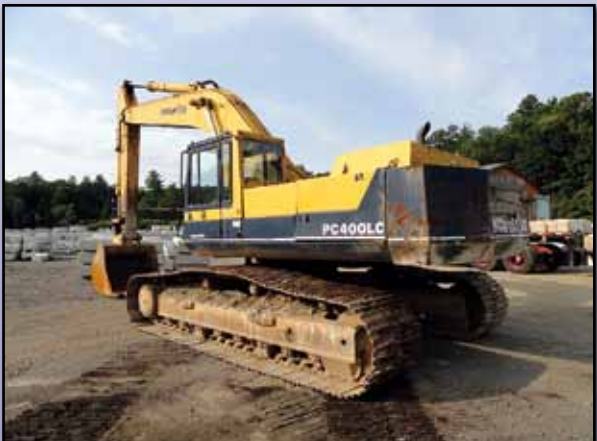
84 KOMATSU PC400LC-3

2000 KOMATSU Model PC400LC-6LK Hydraulic Excavator , s/n A84137, Komatsu diesel, 11'2" stick with hydraulic beyond, JRB hydraulic quick coupler, Geith 48" digging bucket, 35.5" TBG pads, 17'6" crawlers, and enclosed cab with A/C. In good condition with good to very good undercarriage. (3,500 Hours on New Swing Gear, Quick Coupler, Cylinder Rebuilds, Pins and Bushings)