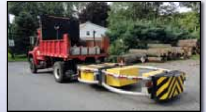
87 INT'L 1954 WITH SCORPION ATTENUATOR

1987 INTERNATIONAL Model 1954 Single Axle Dump/Attenuator Truck , International DT466 diesel and auto trans, J&J 10' steel dump, Scorpion 10,000 attenuator (TMA No. 03282) with solar arrowboard (frame welded to dump bed bulkhead), air brakes, and 10.00-20 front and 11R22.5 rear tires.