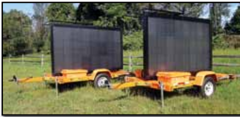
12 SOLAR TECH MESSAGE BOARDS

2009 EARTHCAM Mobile Trailer Cam Advanced , s/n ECCS09200, solar power with battery backup, traffic data sensor, robotic 360° dome camera, 35X optical and 12X digital zoom, 42' stainless steel power mast. Used on (1) job. In good to very good condition.