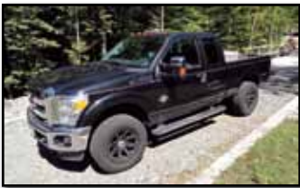
'11 FORD F350XLT

black alloy wheels, and 275/65R20 tires. In good to very good condition with good tires. (032,872 Miles)