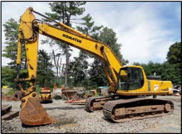
00 KOMATSU PC400LC-6LK

2001 CATERPILLAR Model 345BL Series II Hydraulic Excavator , s/n AGS00786, Cat diesel, 13' stick, hydraulic quick coupler, 60" digging bucket, 35.5" TBG pads, 17'6" crawlers, and A/C. In good condition with good undercarriage. (5,021 Hours) (Purchased New)