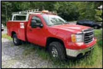
'09 GMC 3500 4X4

1997 FORD Model F450 Super Duty Mason Dump , Powerstroke diesel and auto trans, Dejana 10' mason dump body, dual rear wheels, tow package, and 235/85R16 tires. In good condition with good tires.