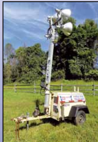
(1) OF (3) LIGHT PLANTS

MILLER BOBCAT Model 250NT Portable Welder Generator , s/n LC344198, 250 Amp Welder/10,000 Watt Generator, Onan gas, mounted on single axle trailer with pintle tow.