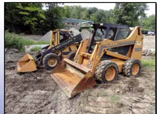
'99 CASE 95XT AND '87 NEW HOLLAND L785

IHI Hydraulic Demo Hammer (Mini) • Grouser Steel Tracks for Skid Steer • (3) 48" Fork Attachments (Skid Steer)