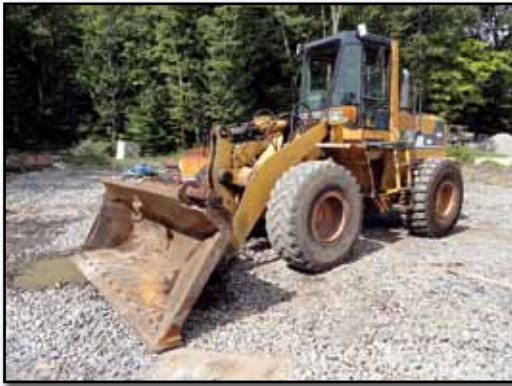
'88 KOMATSU WA320-1

1988 KOMATSU Model WA320-1 Rubber Tired Loader , s/n 10290, Komatsu diesel and powershift trans, hydraulic side dump bucket, hydraulic quick coupler, auxiliary hydraulics, enclosed ROPS cab, and 20.5R25 tires. In fair to good condition with fair to good tires. (Reserved For Use During Loadout For One Week)