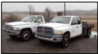
(2) OF (3) DODGE FLATBED TRUCKS