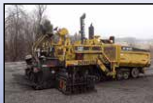
02 CAT AP-1055B

2002 CATERPILLAR AP-1055B Crawler , s/n ABB00442, Cat diesel and hydrostatic trans, Carlson MS10E, 10'-18' heated vibratory screed, s/n 1981, auto slope and grade, and sliding operators console. In good condition with good undercarriage. (Meter Reads 09,102 Hours)