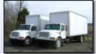
'01 & '99 INT'L 4700

1999 FREIGHTLINER FL70 Single Axle Water Trucks , Cummins 6 cylinder diesel and 6 speed trans, 12' body, 2,000 gallon poly water tank with 3" gas pump and front discharge coupler, 100 gallon external fuel tank, air ride suspension, 26,000# GVWR, ac, cruise control, and heated mirrors. In good condition with good tires.