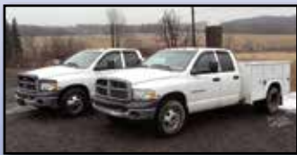
(2) OF (3) '03 DODGE 3500

(2) 2006 CHEVROLET 3500 Crew Cab , 6.0L gas and auto trans, Stahl 8' open utility body • (2) 2005 CHEVROLET 3500 Crew Cab , 6.0L gas and auto trans, Knapheide 8' open utility body • 2005 CHEVROLET 2500 , 5.0L gas and auto trans, Stahl 8' open utility body • (2) 2004 CHEVROLET 3500 Crew Cab , Vortec 6.0L gas and auto trans, 8' open utility body • 2003 CHEVROLET 3500 Crew Cab , 6.0L gas and auto trans, Stahl 8' open utility body • 2003 CHEVROLET 3500 Crew Cab , 6.0L gas and auto trans, 8' open utility body • (3) 2003 DODGE Ram 3500 Crew Cab , Hemi 5.7L gas and auto trans, Reading 8' open utility body • 1998 INTERNATIONAL 4700 , Int'l DT466E diesel and 5 speed trans, 13' open service body