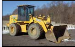
03 JOHN DEERE 544H

2003 JOHN DEERE 544H , s/n 587897, JD 6.8L diesel and powershift trans, gp loader bucket with bolt-on cutting edge, ride control, EROPS with heat and ac, and 20.5R25 tiers. In good condition with fair to good tires. (Meter Reads 5,297 Hours)