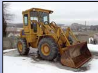
83 KOBELCO LK300A

1983 KOBELCO LK300A , s/n LK300-2682, 6 cylinder diesel and powershift trans, gp loader bucket with bolt-on cutting edge, EROPS, and 16.9-24 tires. In fair condition with good to very good tires. (Meter Reads 6,102 Hours)