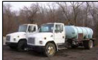
(2) '99 FREIGHTLINER FL70

2001 INTERNATIONAL 4700 Single Axle Van Body Truck , Int'l DT466E diesel and 5 speed trans, Morgan 24" aluminum van body, roll-up rear door, heated mirrors, ac, cruise control, and 295/75R22.5 tires. In good condition with good tires.