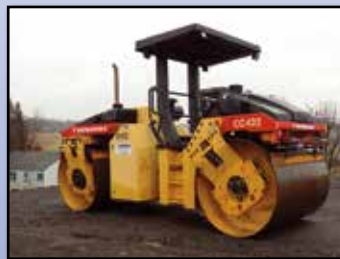
'99 DYNAPAC CC422

1999 DYNAPAC CC422 Tandem Vibratory Roller , s/n 62510728, Cummins 4 cylinder diesel and hydrostatic trans, 66" smooth drums, drum cleaners, water system, sliding operators console, and ROPS canopy. In good condition. (Meter Reads 0,386 Hours)