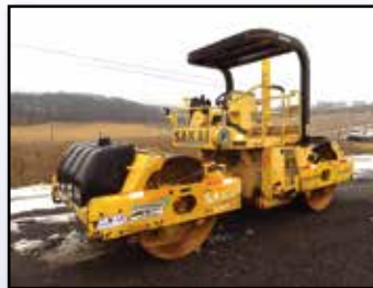
'07 SAKAI SW800

2007 SAKAI SW800 Tandem Vibratory Roller , s/n VSW25-30139, Isuzu diesel and hydrostatic trans, 67" smooth drums, drum cleaners, 3-speed vibration, water system, sliding operator console, and ROPS canopy. In good condition. (Meter Reads 3,202 Hours) (Purchased New)