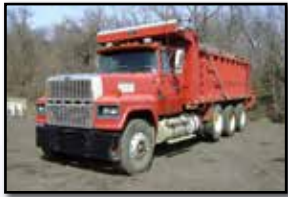
'95 FORD LTL9000

aluminum front wheels, 315/80R22.5 front, 11R24.5 lift and rear tires. In good condition with fair tires.