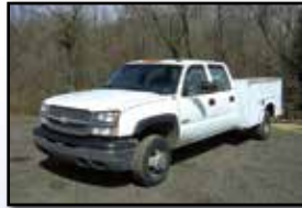
(1) OF (9) CHEVY UTILITY TRUCKS

(2) 2006 CHEVROLET 3500 Crew Cab , 6.0L gas and auto trans, Stahl 8' open utility body • (2) 2005 CHEVROLET 3500 Crew Cab , 6.0L gas and auto trans, Knapheide 8' open utility body • 2005 CHEVROLET 2500 , 5.0L gas and auto trans, Stahl 8' open utility body • (2) 2004 CHEVROLET 3500 Crew Cab , Vortec 6.0L gas and auto trans, 8' open utility body • 2003 CHEVROLET 3500 Crew Cab , 6.0L gas and auto trans, Stahl 8' open utility body • 2003 CHEVROLET 3500 Crew Cab , 6.0L gas and auto trans, 8' open utility body • (3) 2003 DODGE Ram 3500 Crew Cab , Hemi 5.7L gas and auto trans, Reading 8' open utility body • 1998 INTERNATIONAL 4700 , Int'l DT466E diesel and 5 speed trans, 13' open service body