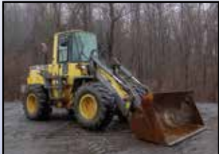
99 KOMATSU WA250-3PT

1999 KOMATSU WA250-3PT , s/n A75244, Komatsu 6 cylinder diesel and powershift trans, JRB 3 cubic yard gp loader bucket with bolt-on cutting edge, JRB hydraulic coupler, auxiliary hydraulics, EROPS, and 20.5x25 tires. In good condition with good tires. (Meter Reads 7,898 Hours)