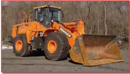
13 DOOSAN DL420-3