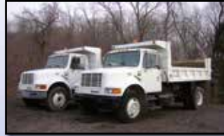
'97 & '98 INT'L DUMPS

1998 INTERNATIONAL 4700 Single Axle Dump Truck , Int'l DT466E diesel and 5 speed trans, Thiele 12' steel dump body, tow package, heated mirrors, cruise control, and 295/75R22.5 tires. In good condition with good tires.