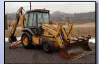
98 CASE 580 SUPER L II