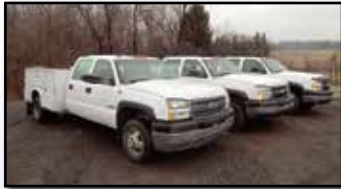
(3) OF (9) CHEVY UTILITY TRUCKS