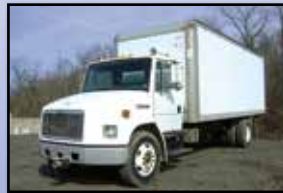
'98 FREIGHTLINER FL70

1999 INTERNATIONAL 4700 Single Axle Van Body Truck , Int'l DT466E diesel and auto trans, Morgan 24" aluminum van body with rollup rear door, curbside door, lift gate, heated mirrors, ac, cruise control, and 295/75R22.5 tires. In good condition with good tires.