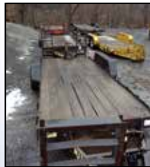
(5) OF (11) TAG-A-LONGS

1995 INTERSTATE 40DLA , 20 Ton Tandem Axle Tag-A-Long Trailer, 8'x24' level deck, 5' beavertail, 4" ramps, 47,350# GVWR, air brakes • 2007 PACE JE714TA2 Tandem Axle Cargo Trailer, 7'x14' aluminum cargo box, swing rear and side doors, 7,000# GVWR • 2012 CAM Superline Tandem Axle Tilt Deck Tag-A-Long Trailer, 6'9"x16' level deck, 2' beavertail, electric brakes, 7,000# GVWR • (2) 2007 PJ Tandem Axle Tilt Deck Tag-A-Long Trailers, 4' front deck, 6'10"x17' tilting section • 2003 CAM Tandem Axle Tilt Deck Tag-A-Long Trailer, 6'6"x16' level deck, 2' beavertail, 13,800# GVWR • 2012 QUALITY FP-7K-23P Tandem Axle Tag-A-Long Trailer, 8'x19' level deck, 4' beavertail, 5' ramps, 15,000# GVWR • (2) 2005 MILLENNIUM M6F18P Tandem Axle Tag-A-Long Trailers, 6'9"x18' level deck, 4' ramp, 12,500# GVWR • 2003 MILLENNIUM M5F16P Tandem Axle Tag-A-Long Trailer, 6'10"x16' level deck, 4' ramps, 9,990# GVWR • 1995 INTERSTATE Tandem Axle Tag-A-Long Trailer, 7'6"x11'4" level deck, 32" beavertail, 48" ramps