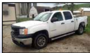
'09 GMC SIERRA

2009 GMC Sierra Crew Cab, Vortec 4.8L gas and auto trans • 2008 CHEVROLET Crew Cab, 4.8L gas and auto trans • 2005 GMC 2500HD , 6.0L gas and auto trans • 2003 DODGE Ram 2500 Crew Cab , Hemi 5.7L gas and auto trans