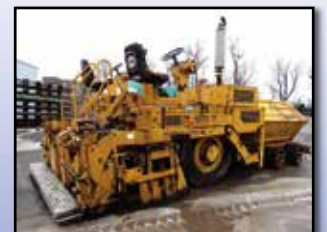
00 BLAW KNOX PF-3200

2005 CATERPILLAR AP-655C Crawler , s/n AYP00251, Cat diesel and hydrostatic trans, Cat Extend-A-Mat 8-16B, 8'-16' heated vibratory screed, s/n BWL00167, auto slope and grade, dual operator controls, and 16" rubber tracks. In good condition with good undercarriage. (Meter Reads 6,081 Hours)