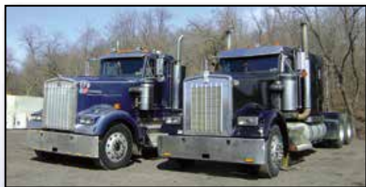
(2) OF (3) KENWORTH W900

1997 KENWORTH W900 Tandem Axle Truck Tractor , Cummins N-14, 435HP diesel and Eaton Fuller 13 speed trans, 60" sleeper, wetline, air slide 5th wheel, air ride suspension, 3-stage engine brake, 48,000# GVWR, 267" wheelbase, aluminum wheels, heated mirrors, ac, cruise control, and 11R24.5 tires. In fair condition with good tires.