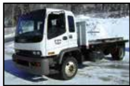
'97 GMC T6500

(2) 2003 DODGE Ram 3500 Crew Cab , Hemi 5.7L gas and auto trans, 10' flatbed with 8' wood stake sides • 2000 DODGE Ram 3500 , Magnum V-8 gas and auto trans, 8' flatbed body • 1999 FORD F-350 , Powerstroke 7.3L diesel and auto trans, 12' flatbed • 1998 FREIGHTLINER FL70 , diesel and 6 speed manual trans, 24" flatbed body, air brakes, spring suspension, 26,000# GVWR • 1997 GMC T6500 , Cat 3116 diesel and 6 speed trans, 18" flatbed body, 25,740# GVWR