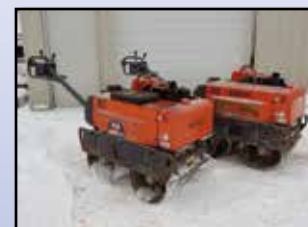
'11 BELLE BWR650

(2) 2011 BELLE BWR650 Walk Behind Compactors , s/n 351093 and s/n 351084, Kubota 1 cylinder diesel and hydrostatic trans, 25.5" smooth drums, drum cleaners, and water system. In good condition. (Purchased New)