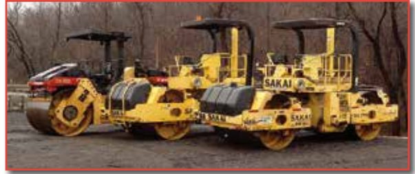
(3) OF (5) TANDEM ROLLERS