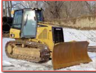
12 CAT D5KXL