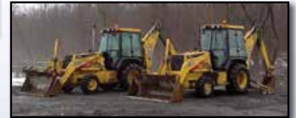
99 & 97 JD 310E

Backhoe Attachments: 48", 45", and 42" Hanging Bucket Forks • 20" Bolt-On Asphalt Cutter • 30" Digging Bucket (Older Case 580)