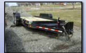
(1) OF (11) TAG-A-LONGS

1995 INTERSTATE 40DLA , 20 Ton Tandem Axle Tag-A-Long Trailer, 8'x24' level deck, 5' beavertail, 4" ramps, 47,350# GVWR, air brakes • 2007 PACE JE714TA2 Tandem Axle Cargo Trailer, 7'x14' aluminum cargo box, swing rear and side doors, 7,000# GVWR • 2012 CAM Superline Tandem Axle Tilt Deck Tag-A-Long Trailer, 6'9"x16' level deck, 2' beavertail, electric brakes, 7,000# GVWR • (2) 2007 PJ Tandem Axle Tilt Deck Tag-A-Long Trailers, 4' front deck, 6'10"x17' tilting section • 2003 CAM Tandem Axle Tilt Deck Tag-A-Long Trailer, 6'6"x16' level deck, 2' beavertail, 13,800# GVWR • 2012 QUALITY FP-7K-23P Tandem Axle Tag-A-Long Trailer, 8'x19' level deck, 4' beavertail, 5' ramps, 15,000# GVWR • (2) 2005 MILLENNIUM M6F18P Tandem Axle Tag-A-Long Trailers, 6'9"x18' level deck, 4' ramp, 12,500# GVWR • 2003 MILLENNIUM M5F16P Tandem Axle Tag-A-Long Trailer, 6'10"x16' level deck, 4' ramps, 9,990# GVWR • 1995 INTERSTATE Tandem Axle Tag-A-Long Trailer, 7'6"x11'4" level deck, 32" beavertail, 48" ramps