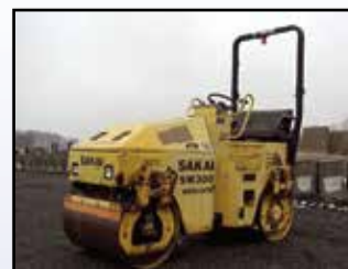
'05 SAKAI SW300

2005 SAKAI SW300 Tandem Vibratory Roller , s/n VSW29-30196, Kubota 3 cylinder diesel and hydrostatic trans, 39" smooth drums, drum cleaners, variable speed vibration, water system, and ROPS post. In good condition. (Meter Reads 2,523 Hours) (Purchased New)