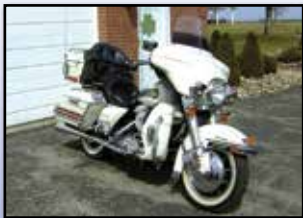
'97 HARLEY ULTRA CLASSIC

2002 HARLEY DAVIDSON Springer Soft Tail Motorcycle , 1450CC gas and 5 speed trans. In good condition with good tires. (Odometer Reads 3,200 Miles)