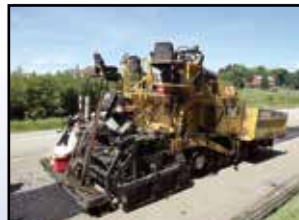
05 CAT AP-655C

2000 BLAW-KNOX PF-3200 Rubber Tired , s/n 320027-89, Cummins 6 cylinder diesel and hydrostatic trans, Omni 3A, 10'-20' heated vibratory screed, s/n 10562-170, tandem steering bogies, front wheel assist, and 18.00-25 tires. In good condition with good tires. (Meter Reads 0,583 Hours) (Purchased New)