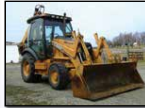
02 CASE 580 SUPER M

1999 JOHN DEERE 310E, 4x4 Extend-A-Hoe , s/n 874551, JD diesel and shuttle trans, gp loader bucket with bolt-on cutting edge, 24" digging bucket, EROPS with heat, 12-16.5 front and 19L-24 rear tires. In good condition with fair to good tires. (Meter Reads 07,568 Hours)