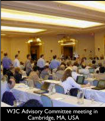
W3C Advisory Committee meeting in Cambridge, MA, USA