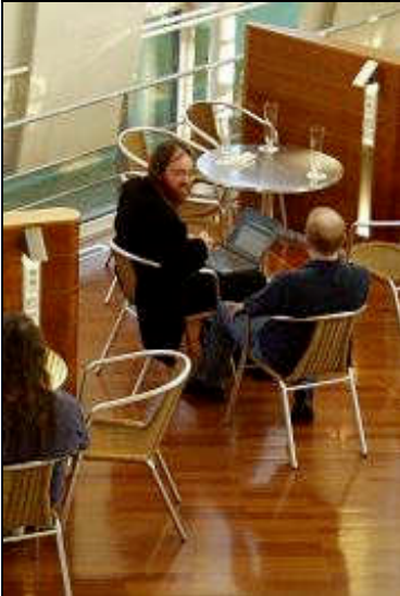
Conversation between W3C meetings in Budapest, Hungary