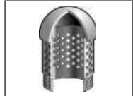
W-31-PERF and F1830-PD-3