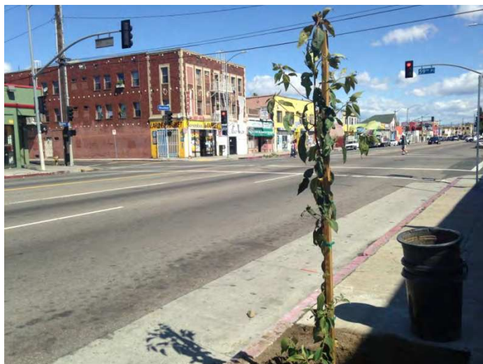
The organization City Plants spearheaded the installation of 120 trees on Broadway in South L.A. in April, partially to combat urban pollution.

Latinos represent a majority of the top ten percent of most of the polluted areas, although only 37.6 percent of California residents are Latino.