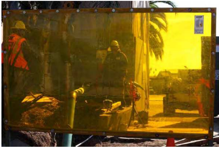
A look into the Murphy oil drilling site in the residential West Adams neighborhood of South L.A.