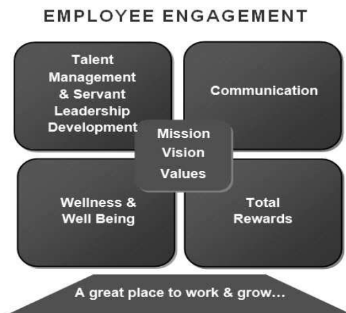
Figure 1. Key Drivers of Employee Engagement.

As indicated above, the Clinic's new people strategy was designed to address several of the key drivers of engagement, as illustrated in Figure 1, and each of the components of this strategy would prove to be critical to improving engagement. But given the critical relationship between leadership and engagement, one of the most important of the Clinic's engagement initiatives has arguably been the on-going effort to implement the concept of Servant Leadership.