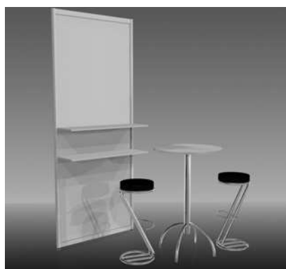
Furniture Package A

Place of performance and jurisdiction is Cologne.