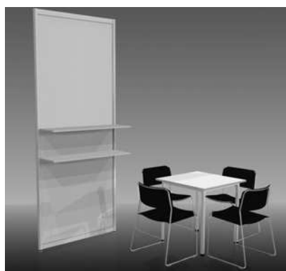
Furniture Package C

In addition to the basic equipment, we hereby order the following items (for an additional fee):