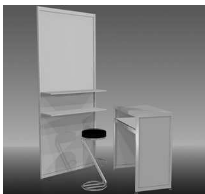
Furniture Package B