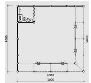
Sample: stand 16 sqm

*Applications received after this date will be dealt with according to availability.