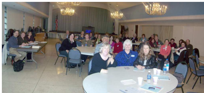
Meeting in Pasadena