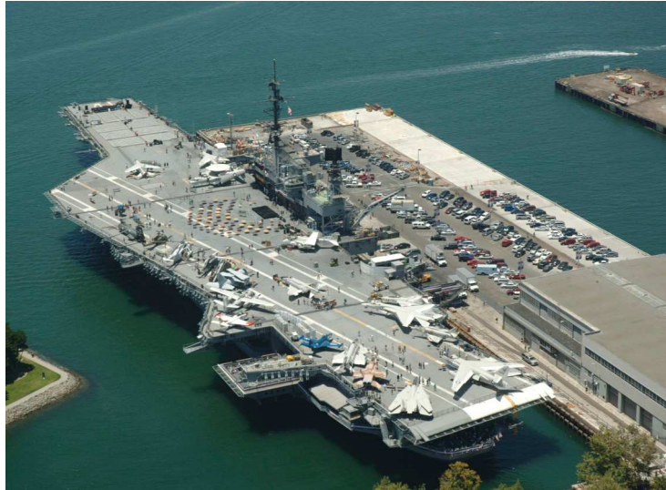
A dinner-tour aboard the historic USS Midway aircraft carrier museum awaits Conference Youth Choir singers!