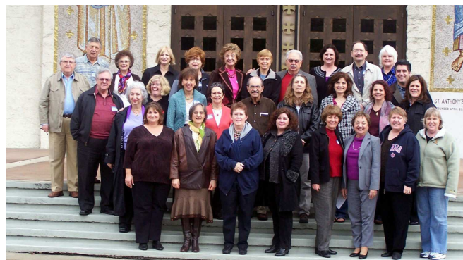
Delegates taking a break