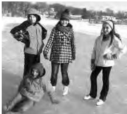
Ice Skating on the Iowa River across from Riverbend Middle School was one of the science club activities during the 2013-2014 school year.

Those students interested in joining science club who participate in other after school activities, such as sports, may join us between the seasons. The more, the merrier!