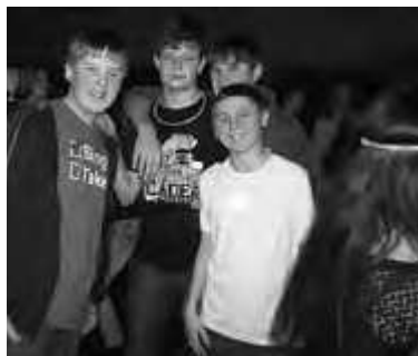
Students enjoy a Riverbend Middle School dance during the 2013-2014 school year.

All Riverbend teachers will be assembled at tables in the gymnasium