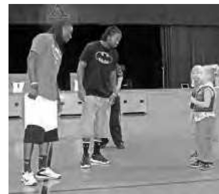
Two Iowa Barnstormers visited Alden Elementary earlier in September. Students asked questions about their careers, leadership, and more!