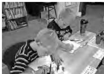
Students are learning about classroom expectations and working hard to start the year!