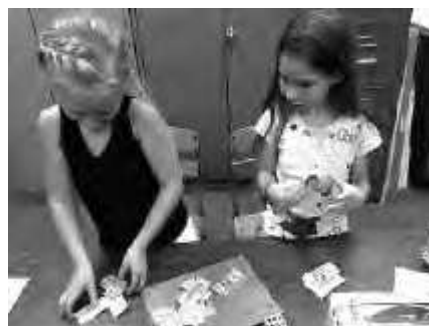
Students in 2nd grade synergize to complete a math assignment!