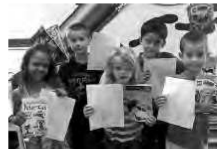
Students wrote thank you notes to Walmart for new books and other classroom supplies due to Walmart's generous donation of gift cards!