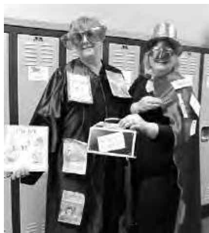
Teachers assumed their super hero identities in a special school wide assembly.

November 26-28: No School, Thanksgiving Break