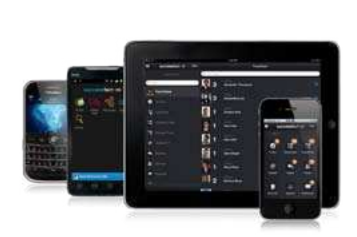
The BizX Mobile app is available for iPhone, iPad, Android and BlackBerry