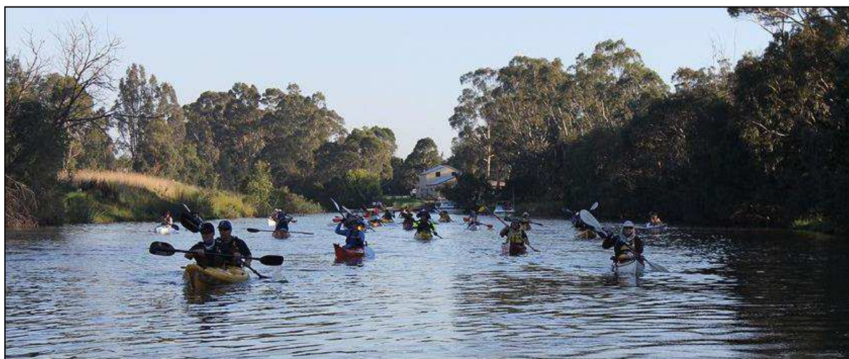
Day 1 2013 – Paddlers depart the Port of Sale.

Additional exposure - is received through websites of sponsors, Facebook, Sale to Sea website ( www.saletosea.com ) and kayaking websites as far reaching as Italy. Feedback has been received from Italy, the US, South Africa and New Zealand.