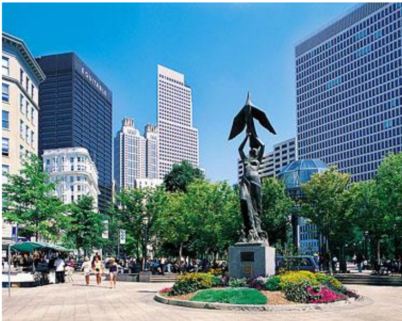
Atlanta: a phoenix rising from the ashes (after Sherman's march)

The American Accounting Association's Annual Meeting will be held in Atlanta, Georgia, August 2–6, 2014 at the Atlanta Marriott Marquis and the Hilton Atlanta.