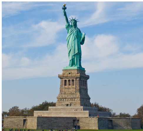
New York, NY (August 6-10, 2016)