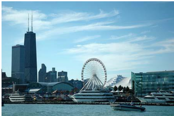
Chicago, IL (August 8-12, 2015)

Future AAA Annual Meetings will be held in: