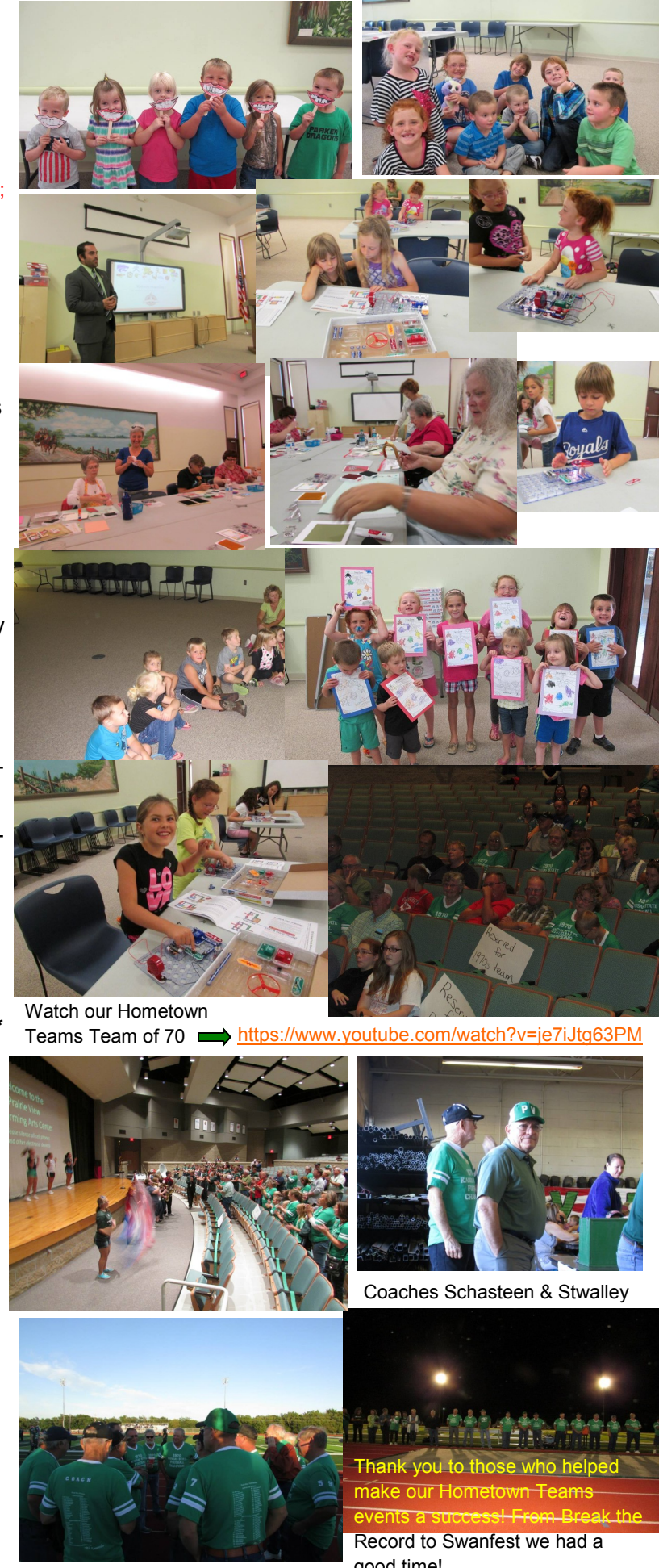
Watch our Hometown Teams Team of 70 → https://www.youtube.com/watch?v=je7iJtq63PM