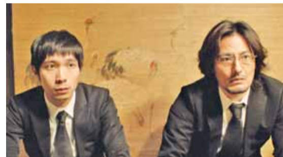
A scene from Japanese director Toshimichi Saito's short movie "A Warm Spell"

The jury panel composed of international cineas-