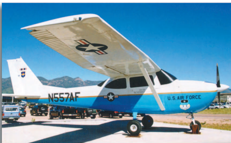
The Air Force Academy T-41

From the early 1920s until the beginning of the 1980s, names like Cessna, Beechcraft and Piper were synonymous with general aviation. The vast majority of all the general aviation aircraft flying anywhere in the world were manufactured in the United States. Most of them were built by Cessna, Piper and Beech Aircraft, and were built before 1980.