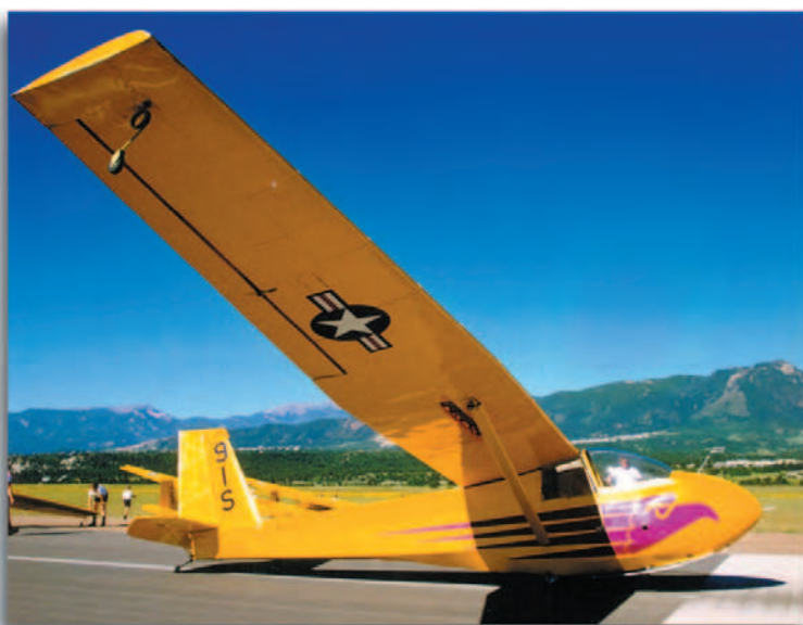
The TG-4A sailplane is the aircraft used to train Air Force Academy cadets.

There is a group of aviators who fly unpowered sailplanes. Their sport is often called soaring or gliding, but there is a big difference between the two. Gliding is the controlled descent of an unpowered aircraft while soaring is flying without engine power and without loss of altitude. If a sailplane is towed up to altitude and after release it descends to a landing, that is gliding. Similarly, if a person with a hang glider jumps from a high place and descends to a landing, that is gliding. Soaring, on the other hand, involves finding and riding air currents so that the aircraft remains aloft or even gains altitude.