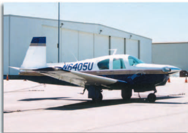
The Mooney 201

The Mooney 201 is an all-metal, low-wing aircraft with a retractable tricycle landing gear. It has a payload of about 1,000 pounds and a 1,100-mile range. The Mooney 201 is powered by a 200-horsepower Avco Lycoming engine, which gives it a cruising speed of 160 to 190 mph. There’s an interesting bit of trivia about Mooney. At one point in their manufacturing history, they produced an airplane that had a Porsche engine in it!