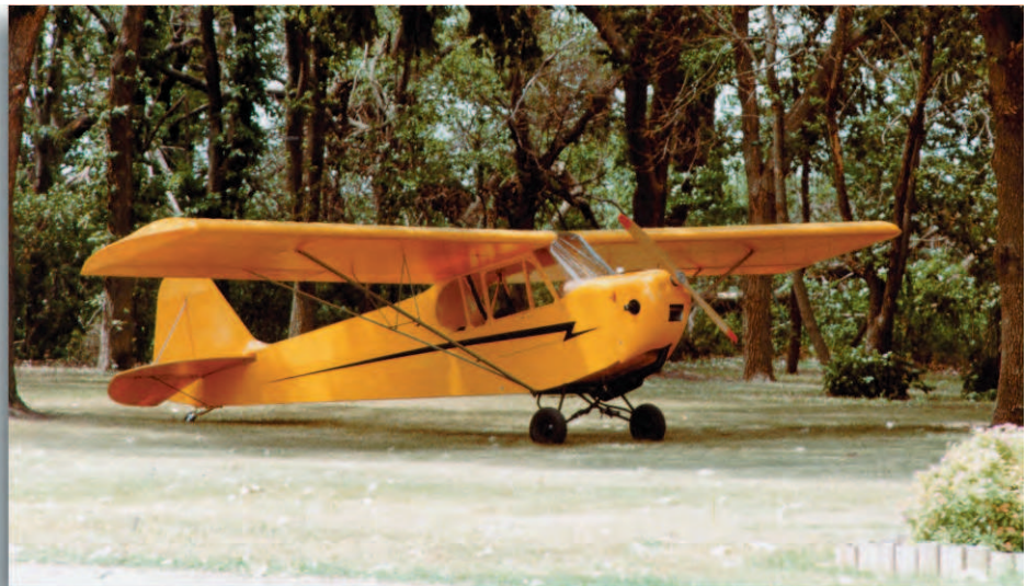
Fisher Flying Product FP202 Ultralight