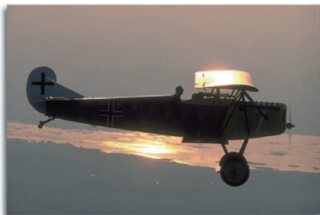
Antique Airplane (EAA)

In order to qualify as an antique, an aircraft must be at least 20 years old. This area of sport aviation is very expensive and generally attracts people from the higher-income levels. When restoring an old aircraft, it is often impossible to obtain the parts you need, so they have to be handmade. For example,