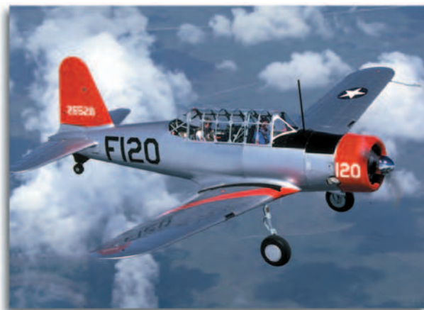
One of the great warbird trainers, the Consolidated Vultee BT-13 (EAA)

to restore a Piper J-3 Cub may cost $20,000 in addition to the $3,000 to $5,000 purchase price. Some of the very rare aircraft can easily cost over $100,000.