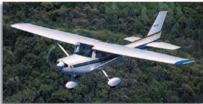
This is the successful Cessna 152. Thousands of pilots have received their entry-level flight training in this aircraft.

This basic trainer went into production in 1978 to replace the well-established Cessna 150. It is 24 feet long, has a 33-foot wingspan and a maximum gross weight of 1,670 pounds. It is powered by a 110-horsepower Lycoming four-cylinder engine. At 8,000 feet and using 75 percent power, the Cessna 152 will cruise at 100 mph for about 650 miles. The fuel economy factor is 28 miles per gallon of fuel, which is excellent for an airplane.