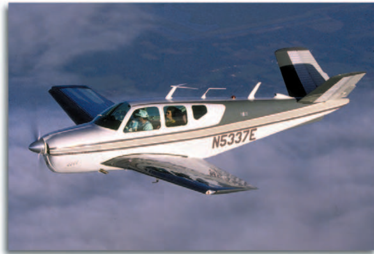
The Beechcraft Bonanza (EAA)

Beechcraft are prestigious aircraft and, like prestigious automobiles, have a great deal of standard equipment.