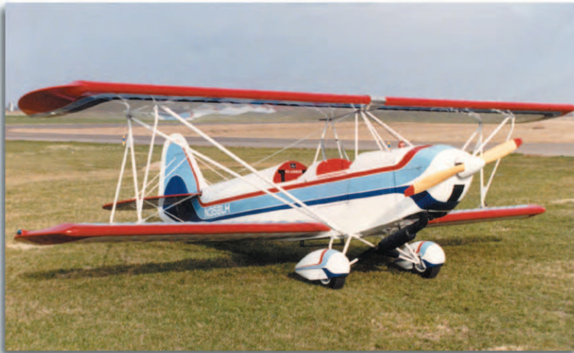
The FFP Classic

This phase of sport aviation combines the love of flying with the hands-on hobbies of woodworking, fabrics, welding, metal working and composite construction. In this endeavor, the pilot actually builds the airplane either from a kit or from a set of plans. For many, the incentive is that they can become an airplane owner by building their own aircraft much more cheaply than by buying one. They can also build an airplane that is sportier looking than a factory-built airplane, or they can even build a replica of a famous “warbird.” The prices vary from only a few hundred dollars for the plans to complete kits costing well over $100,000. A variety of engines are available from two-stroke to modified automotive 4s, V-6s, V-8s and custom built V-12s.