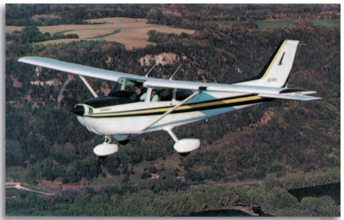
Cessna 172 Skyhawk

The Cessna 172 Skyhawk has a 160-horsepower Lycoming engine and a fixed-pitch propeller. It also has fixed (non-retractable) landing gear. The Skyhawk has a payload of