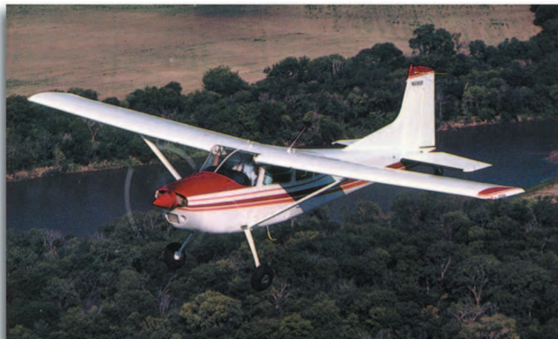
Cessna’s venerable Skywagon

The Cessna 185 Skywagon is a “tail dragger.” You will notice in the figure that the Skywagon has