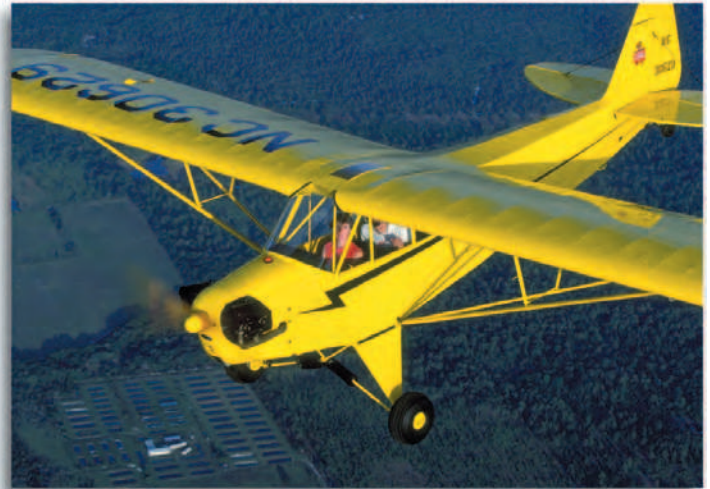
One of the greatest training planes of all time, the Piper J-3 (EAA)

The majority of pilots have received their basic instruction in either Cessna or Piper aircraft. They are small, two-seat aircraft with small engines. They have a low cruising speed and are very easy to fly. These characteristics help develop confidence in the beginning student. The fact that they are also inexpensive to buy, operate, and maintain makes them attractive to flight schools.