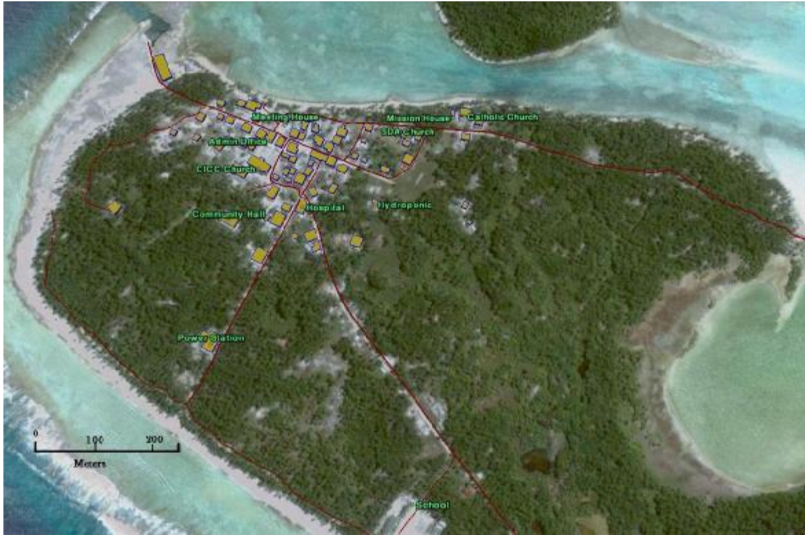
Figure 2: Important places on Rakahanga.

Figure 2 shows critical infrastructure such as the roads, power station, hospital and the administration office where the police, Telecom and the Bank of the Cook Islands offices are located.