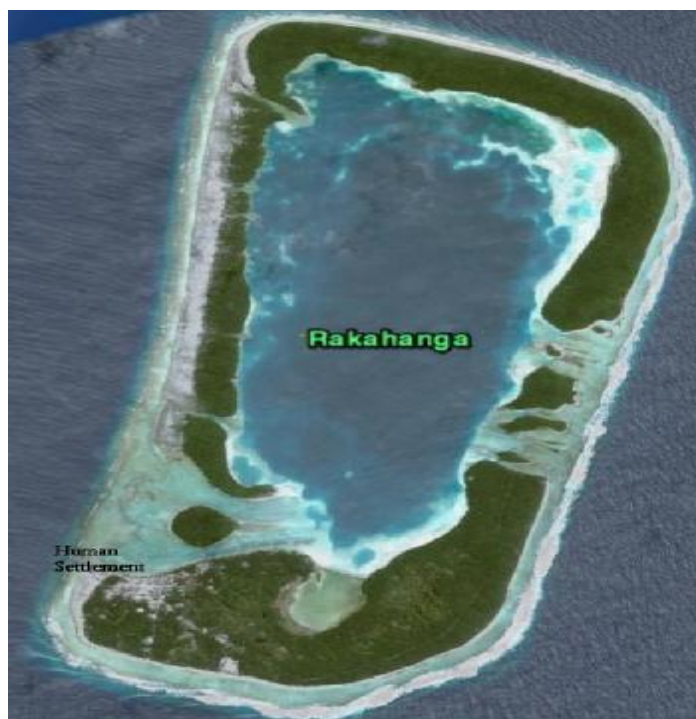
Figure 1 Map of Rakahanga