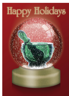
Design 1 (also available in blue, see below)