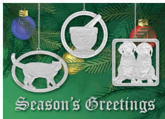
Design 3 (suitable for Vets)