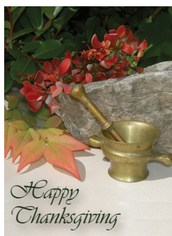
Design 5 (Thanksgiving)