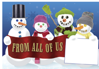
Design 2 (your logo on the sign)