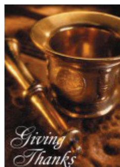
Design 6 (Thanksgiving)